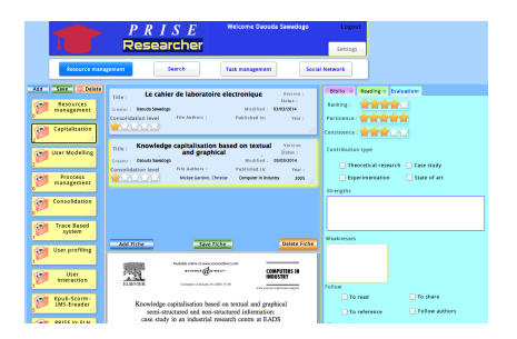
Fig. 2. PRISE digital resources management interface

semi-automated analysis techniques to detect patterns, to identify anomalies, and to extract knowledge from different processes to produce an adaptive process management. This study consists of assisting user in handling digital resources based on a consolidated management of digital resources. The contributions of this proposal are as follows :