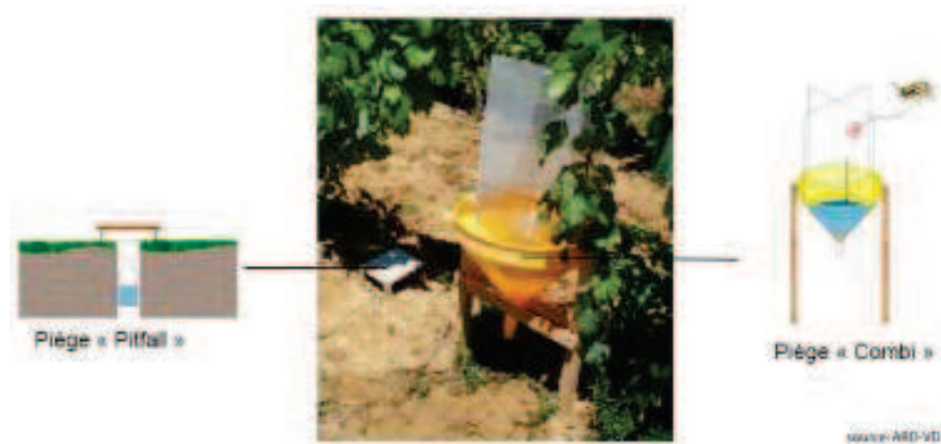
Figure 2. The system of trapping by the RBA method for capturing arthropods by pitfall for crawling insects, and "combi" for flying insects.

Moreover, many public awareness activities and dissemination of the project results are planned throughout the project to interest the greatest number, but also to attract the attention of winemakers and wine professionals such as the creation of a public website ( www.biodivine.eu ), the implementation of information boards on sites, the publications of articles and press releases, the organization of “open days” on experimental sites, as well as training workshops.