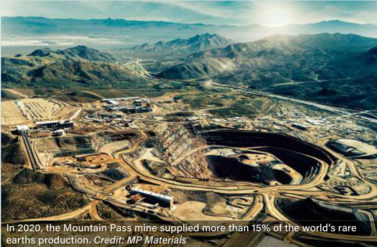
In 2020, the Mountain Pass mine supplied more than 15% of the world's rare earths production.

Las Vegas-based MP Materials operates the Mountain Pass mine near San Bernardino, Calif., 50 miles southwest of Las Vegas. It is an open-pit mine that began operating in the 1950s, and from the 1960s to the 1980s, it was the world's dominant source of rare earths oxides, according to the USGS. But rising demand, coupled with growing environmental concerns and costs, resulted in production there tailing off. By 1990, production in the U.S. was falling quickly, while production in China was accelerating.