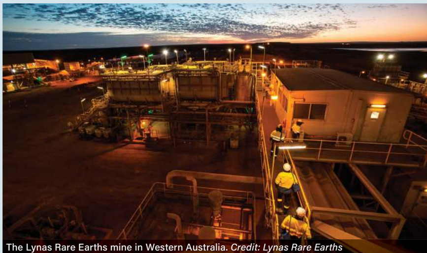
The Lynas Rare Earths mine in Western Australia.

In February 2021, the defense department awarded $30.4 million to Australia-based Lynas Rare Earth Ltd. The grant supports the compa-