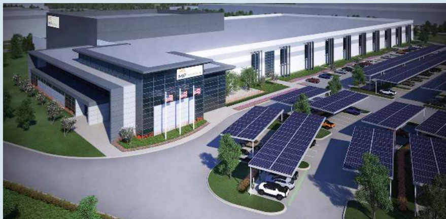
A rendering of MP Materials' planned magnetics facility in Fort Worth, Texas.

And in December, MP Materials announced plans to build a 200,000-square-foot metal, alloy, and neodymium–iron–boron magnet manufacturing facility in Fort Worth, Texas. The company says the facility will have the capacity to produce 1,000 metric tons of magnets a year, with the potential to power about 500,000 electric vehicle motors annually.