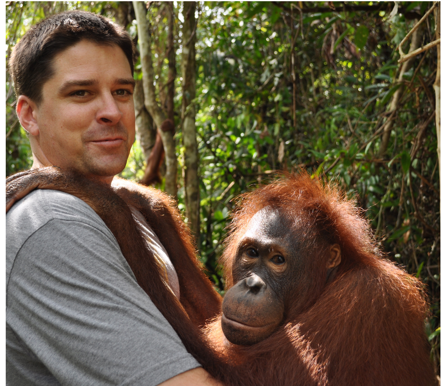
Visiting a REDD Forest Carbon Offset project in Indonesia

As a founding member of the FSC and an international pioneer in responsible forestry certification, SCS has emerged as a leading certifier globally for responsible forestry certifications and services for global chain of custody (CoC) and forest management (FM) standards. Our independent certification of forests and forest-based products ensures that your responsible forestry claims are credible, transparent, and demonstrate impact.