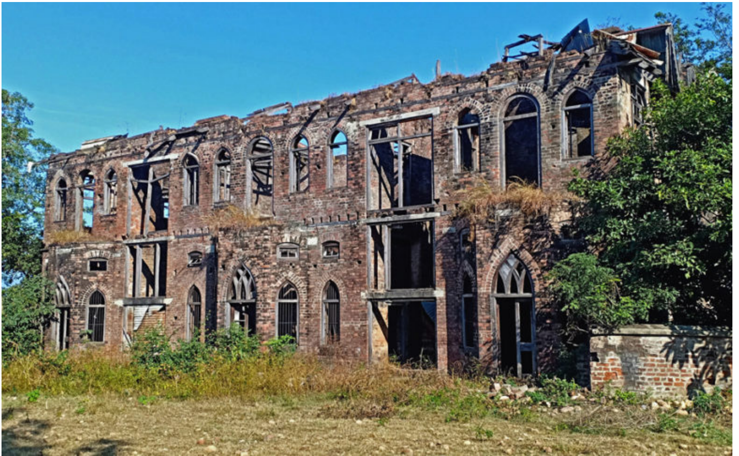
The Dadasiba Fort is an abandoned fortress built in ancient times and showcases ancient architecture on beautifully carved arches.