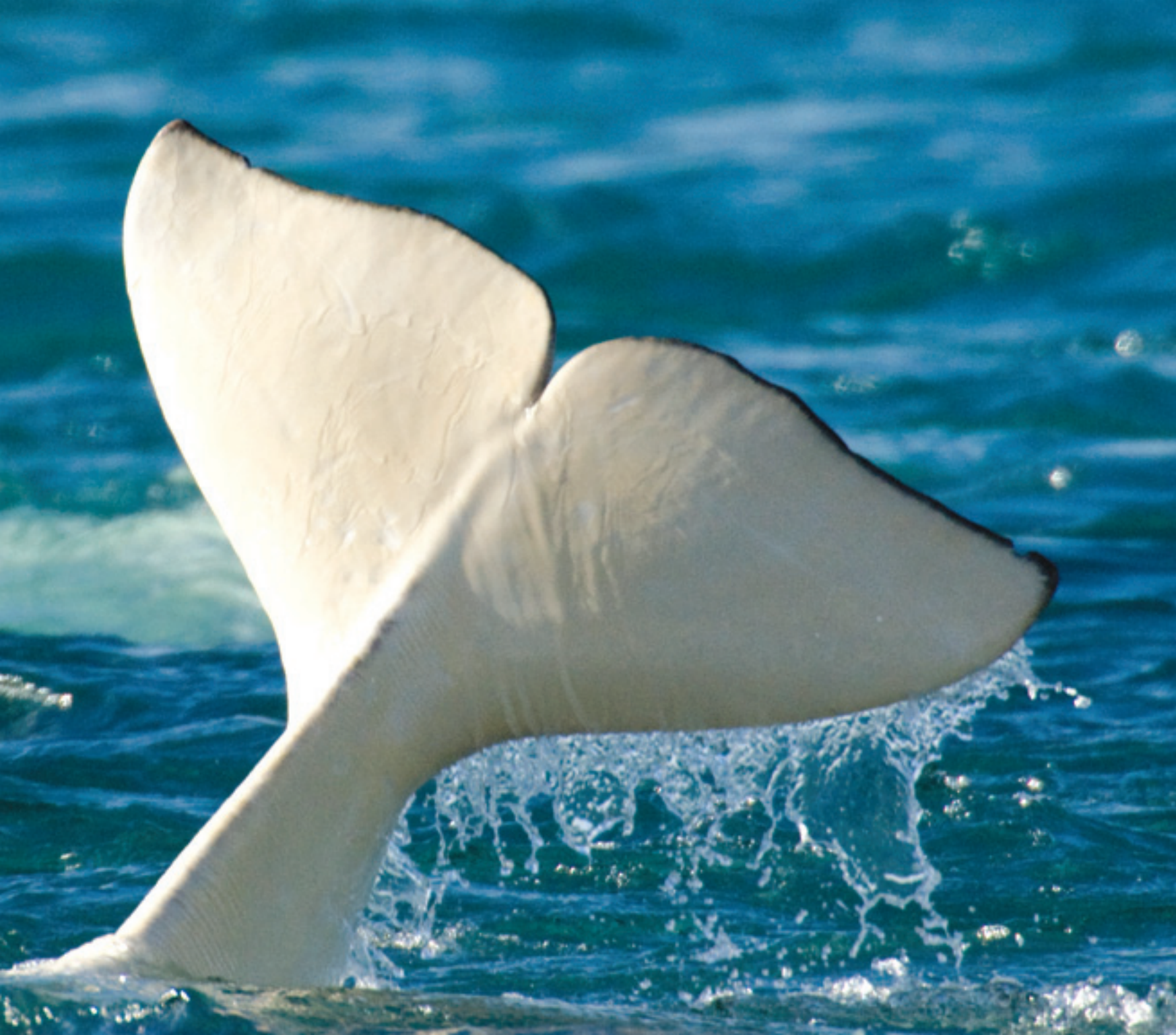
Spectral Q/Whaleman Foundation