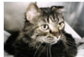
SAPL's efforts in Congress include helping domestic animals slaughtered for food, endangered species around the world and companion animals here at home, stolen and sold to research labs.