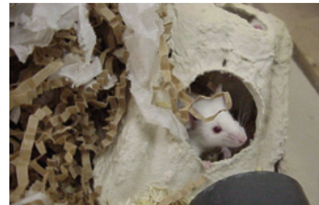
Laboratory mouse making good use of the housing and bedding he has been provided. Denied federal protection, such enrichment is the exception, not the norm.

kept in research facilities. Discussion topics which have been summarized and submitted for publication include: relationships between personnel and animals in the research laboratory; emotionality in the