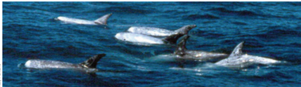
Risso's dolphins are found throughout the world in temperate and tropical waters, including southern California where this adult pod was spotted.

peninsula. We achieved this by alerting the Mexican authorities to the lethal nature of the project, stopping it at the eleventh hour. Four months later, the project's sponsors re-applied, this time partnering with a Mexican University and in concert with a request for a seismic study by a Mexican oil company. Hearings took place