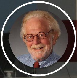
Billy Keyserling Former Mayor Beaufort, South Carolina

“By investing in our most vulnerable community members following a disaster, we can drive a faster and stronger recovery, not only for individuals, but for the region as a whole.”