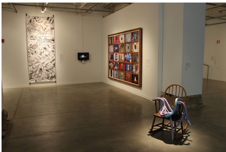
Spring 2014 Department of Art Bachelor of Fine Arts Senior Projects Exhibition at Urban Arts Space.

The Arts Initiative supports a global community of arts educators through collaborative alliances with state, national and international organizations advancing the daily impact of the arts on the city of Columbus. The Arts Initiative at Ohio State serves as an umbrella for multiple aspects of the arts on and off campus and facilitates opportunities for faculty and students to exhibit and perform beyond the university community.