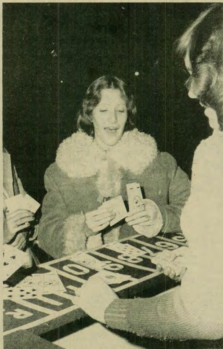
This young woman joined hundreds of other gamblers having some fun at the Mardi Gras for only one dollar. Additional fun is planned for next weekend.

Registration for Free University courses has been rescheduled for Thursday from 8:30 a.m. to 4:30 p.m. in LaFortune Ballroom.