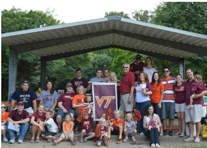
The newly re-organized St. Louis Chapter hosted its first Summer Picnic this year!