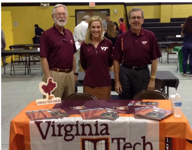
Houston Chapter volunteers participated in twelve area college fairs this fall