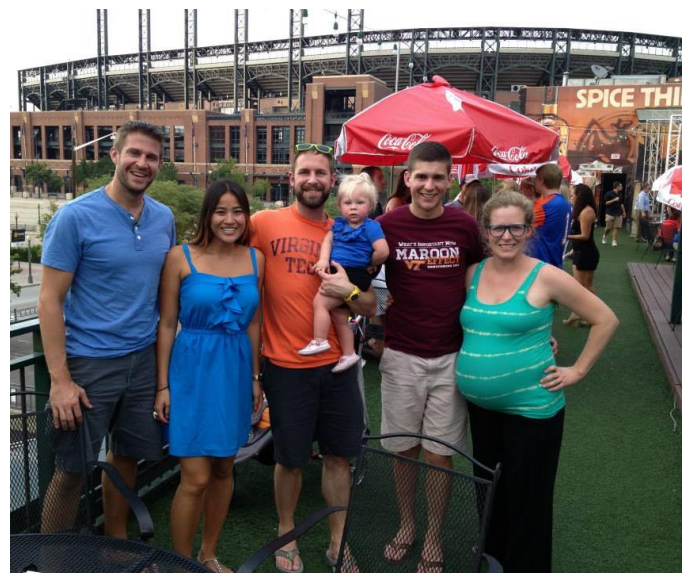
Virginia Tech students and their families join in the Denver Chapter's Football Kick-Off Party in August