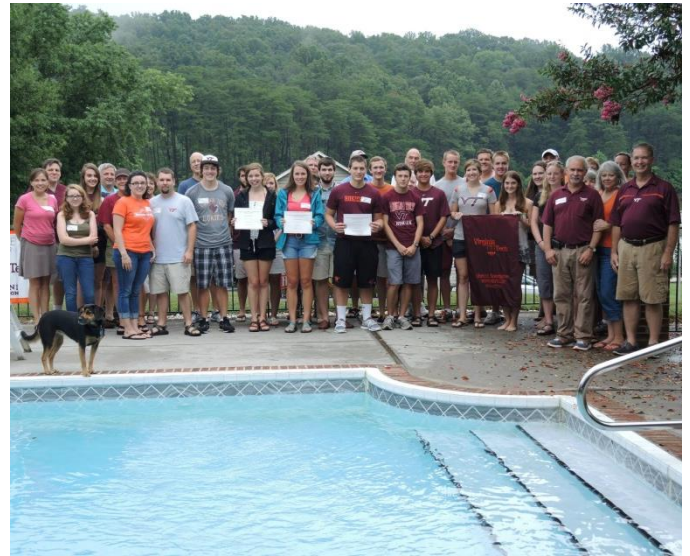
Knoxville Chapter local students and their families gather at the chapter's annual Student Send-Off Picnic

Contact your chapter liaison for more information on how you can reach out to these families and take advantage of the support and enthusiasm that they can bring to your chapter programs.