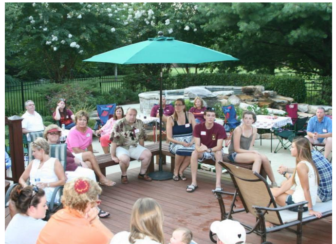
Volunteers from the Middle Tennessee Chapter welcome local freshmen and their families to their Freshman Mixer