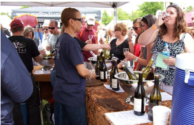
Veritas is a popular winery at the festival