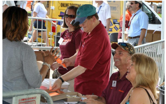
Richmond Chapter volunteers work the admission booth