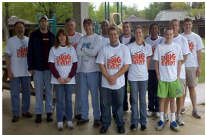
Charlotte Chapter volunteers at Alexander Youth Network