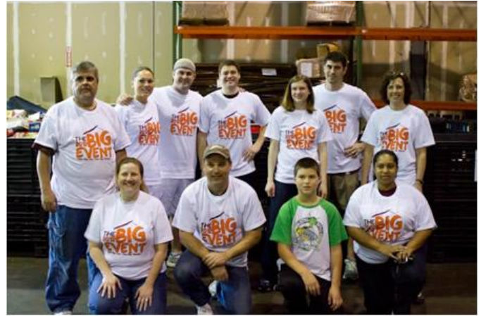
Charlotte Chapter volunteers at the Loaves and Fishes Food Bank

Due to the innovative nature of this new community service program and its connection with an existing university program, the Virginia Tech Alumni Association was pleased to award the Charlotte Chapter with the 2012 Outstanding Community Service Project award.