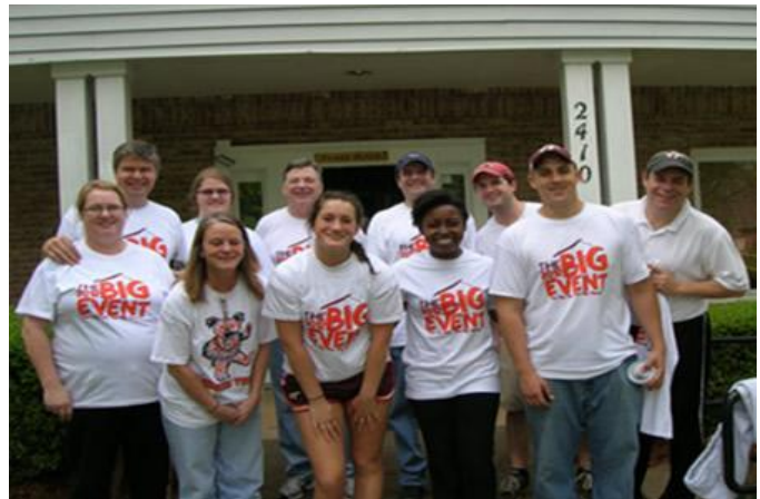
Charlotte Chapter volunteers at Charlotte Family Housing