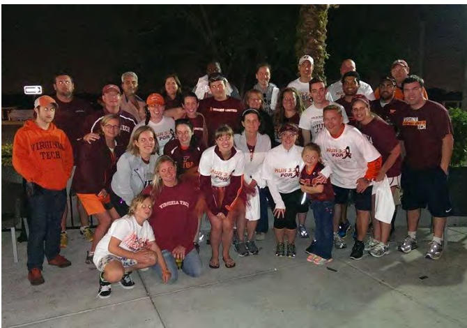
Central Florida Hokies gather in Orlando for their 3.2 for 32 Run in Remembrance

If your chapter would like to begin planning a remembrance event for 2016, please contact your chapter liaison for more information.