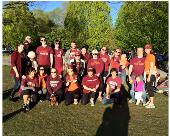
The Seattle Chapter hosted a 3.2 for 32 Walk/Run Remembrance Event