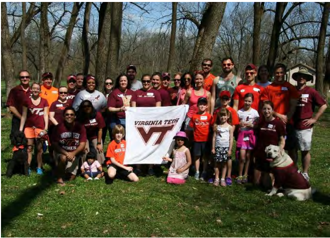
The Philadelphia Chapter hosted a 3.2 for 32 Walk in Remembrance in a local park