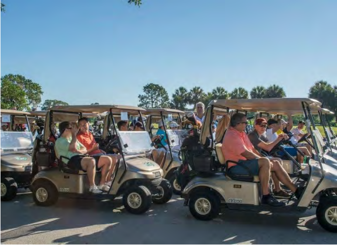
Central Florida Chapter alumni line-up to tee-off for their annual Hokie Golf Outing