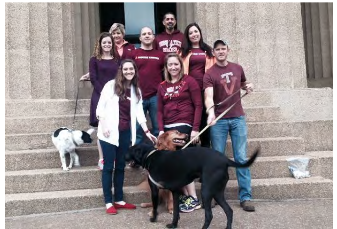
The Middle Tennessee Chapter hosted a "VT Walk to Remember 32" in Nashville