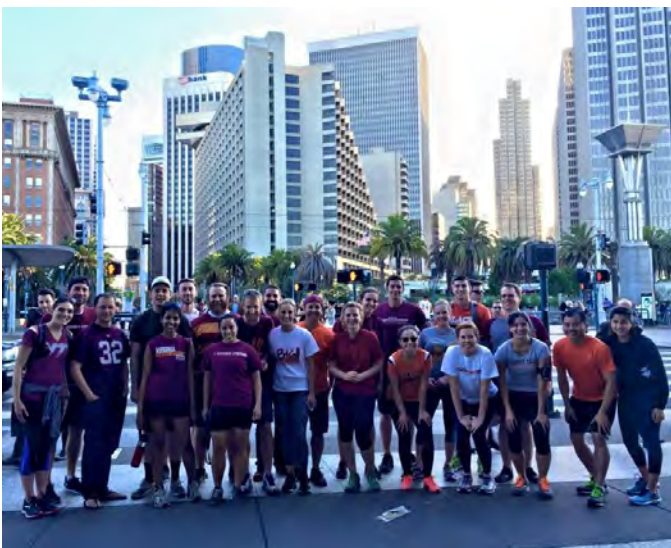
San Francisco area alumni turned out for a run/walk downtown to remember the 32 Hokies lost