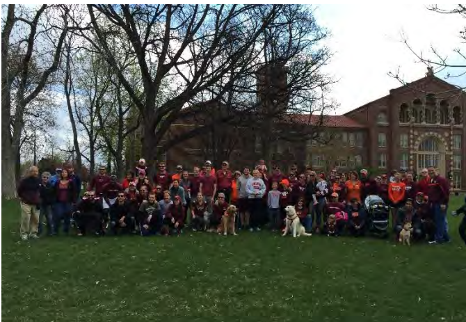
The Denver Chapter had more than 90 Hokies and friends join in for their annual 3.2 for 32 event