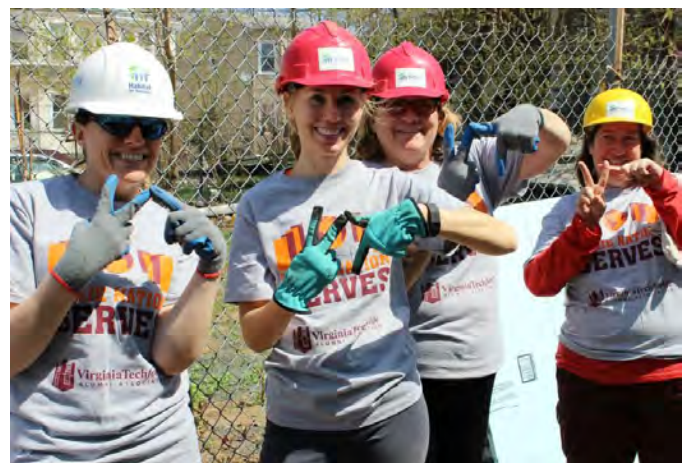
New Jersey alumni put on their hard hats and got to work at a local Habitat for Humanity build