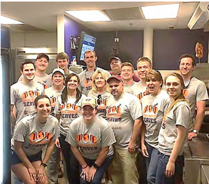
The Palmetto Chapter volunteered at local Flour Field concession stand to support their scholarship fund