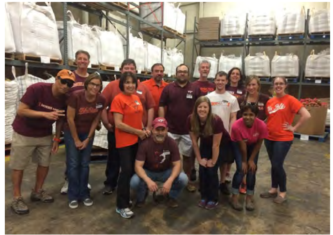
The Triangle Chapter bagged 12,000 pounds of rice at their memorial food bank volunteer event