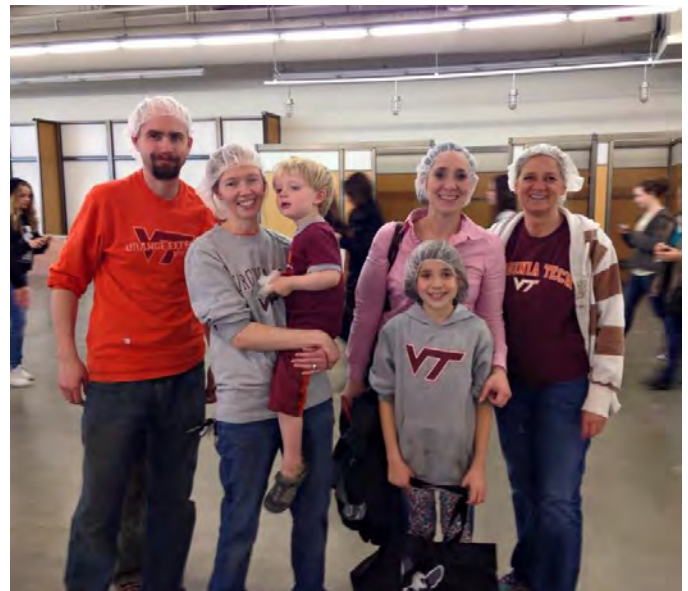
Utah Chapter volunteers also participated in a food bank service event on April 16