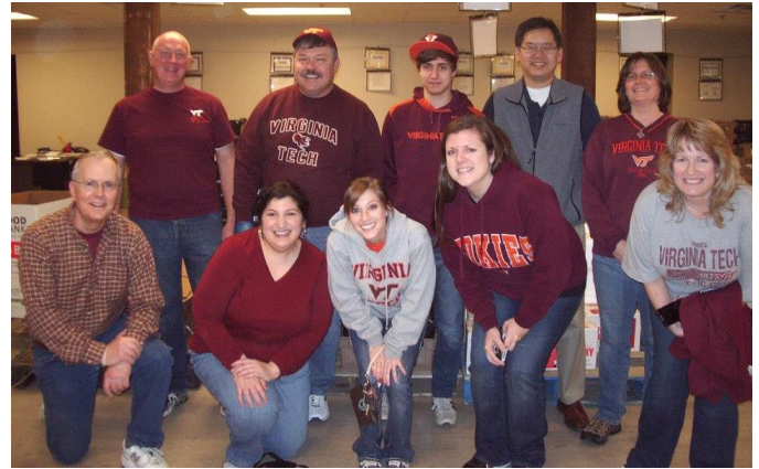
Richmond Chapter alumni volunteer at the Central Virginia Food Bank

The 9 th annual Food Fight was a huge success; with the Hokies proudly beating the 'Hoos, 37,127 points to their 33,548 points! Together, Richmond area alumni raised 68,774 meals for FeedMore and the Central Virginia Food Bank.