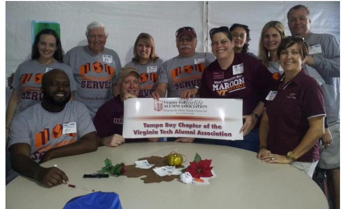
Tampa Bay Chapter volunteers at Metropolitan Ministries