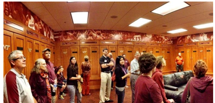
New River Valley Chapter area alumni tour the new Hahn Hurst Basketball Practice Facility