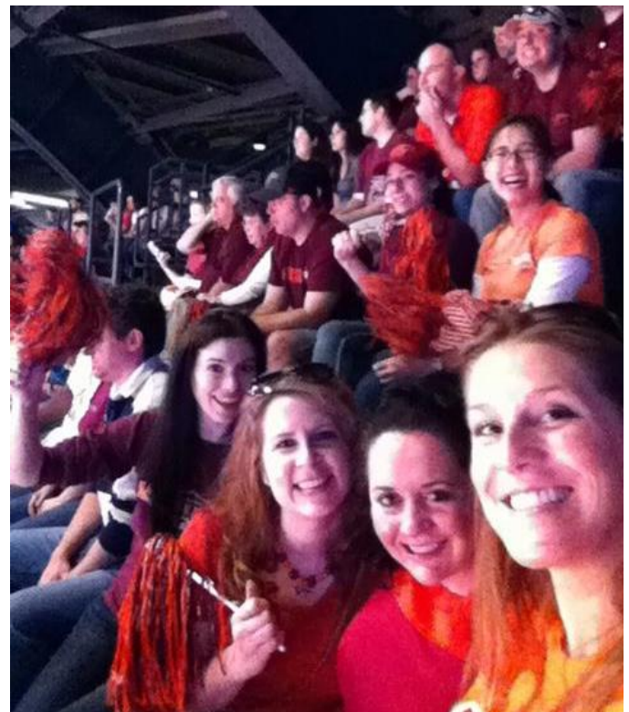
Atlanta Chapter alumni cheer on the Hokies at the Virginia Tech vs. Georgia Tech basketball game at Georgia Tech