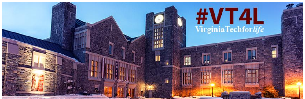
Associate Vice President for Alumni Relations

We look forward to working with you in the upcoming year!