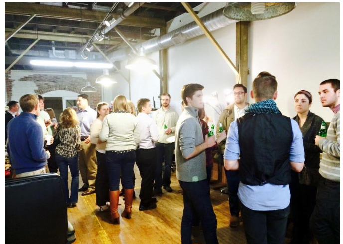
The Middle Tennessee Chapter hosted its first Networking event with music, food, drinks, and lots of Hokies