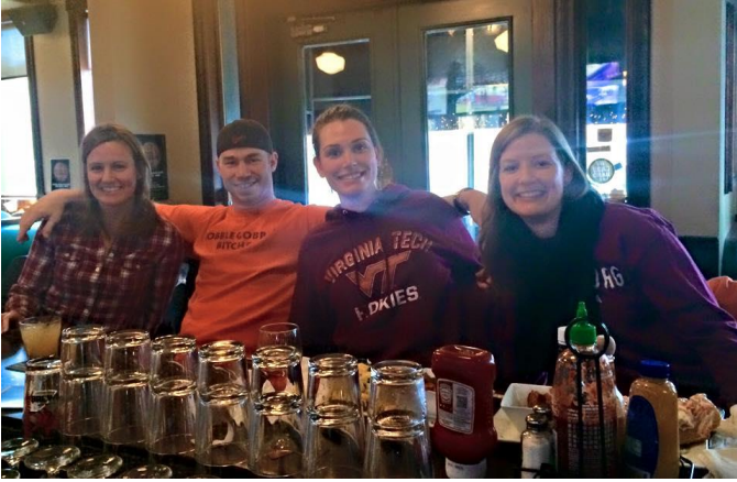
Chicago area alumni joined together in January for a basketball game watching party