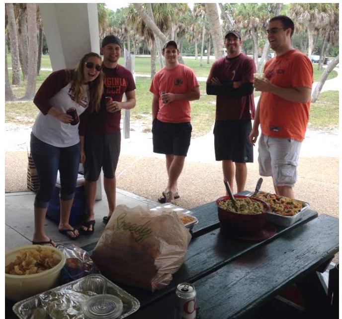
Tampa Bay Chapter alumni enjoy a holiday party on the beach, Florida-style!