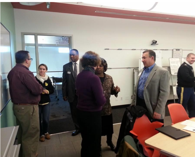
The Richmond Chapter hosts a monthly breakfast networking function for "Hokies Helping Hokies"