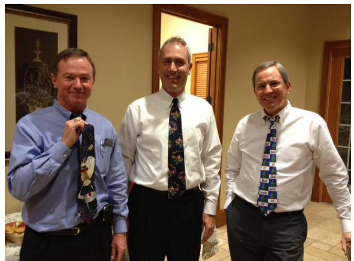
A few adventurous souls from the NC Triad Chapter compete for the "Tackiest Tie" at their holiday party