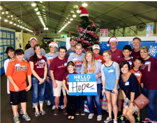
The Tampa Bay Chapter participated in a community service project with Metropolitan Ministries in December