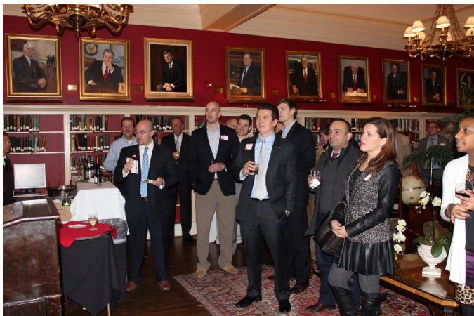
National Capital Region alumni gather for their Hokie Business Owners & Entrepreneurs Networking Session