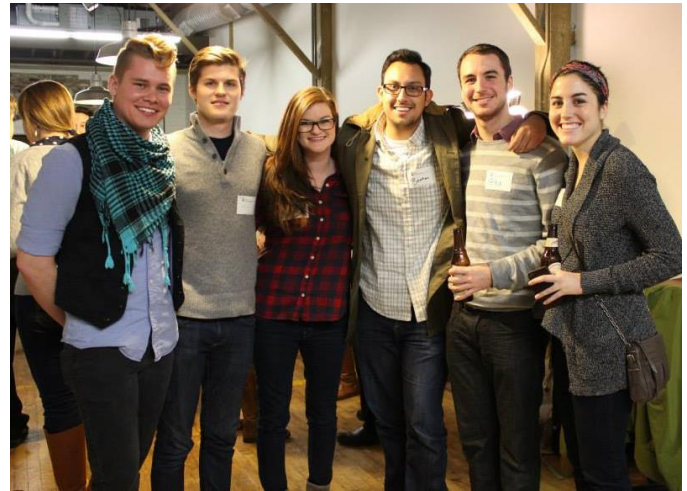
Nashville area alumni meet up for the inaugural “Networking in Nashville” event