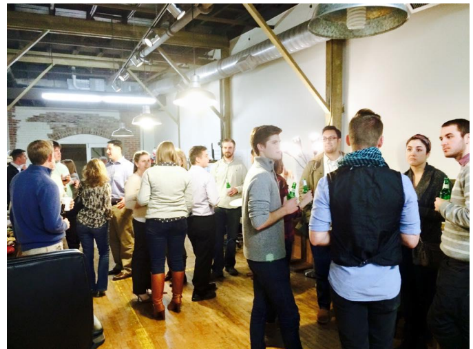
Alumni and other local Nashvillians network during the event at Arrister, which featured food and live music