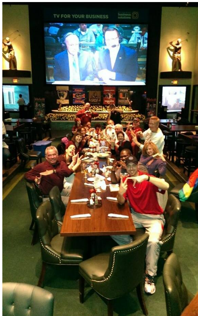
The Central Florida Chapter gathered together to watch the Virginia Tech vs. Miami basketball game and to welcome visiting Alumni Association staff from Blacksburg