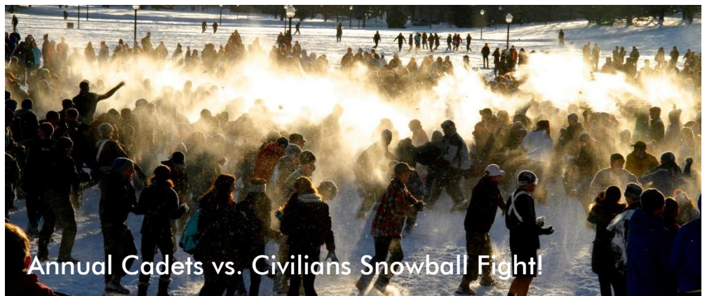
Annual Cadets vs. Civilians Snowball Fight!

Associate Vice President for Alumni Relations