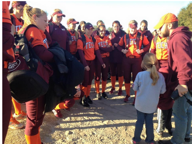
Jacksonville Hokies rooted on the Virginia Tech softball team at a recent tournament in Jacksonville