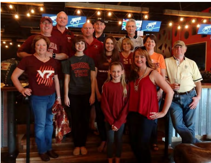
Chattanooga Hokies gathered for an All-ACC Social with alumni from Georgia Tech, Notre Dame, Florida State, and Syracuse