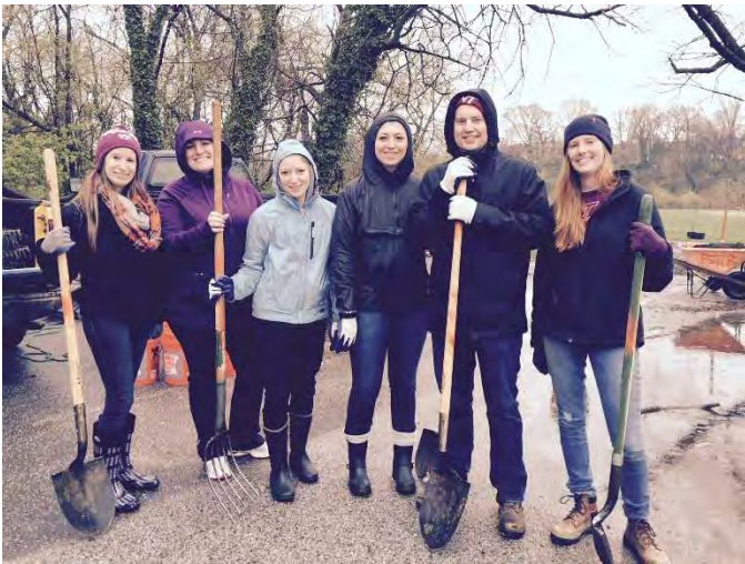
The Baltimore Chapter volunteered to plant trees at a local elementary school