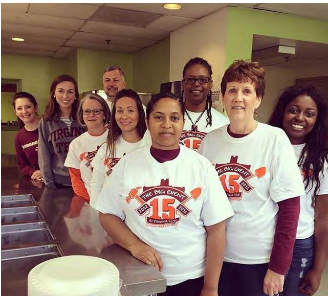
Charlotte Chapter alumni work on another Big Event project: preparing breakfast at Hope Haven