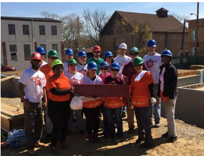
First State Chapter alumni had a terrific turnout and beautiful weather for a local Habitat for Humanity build