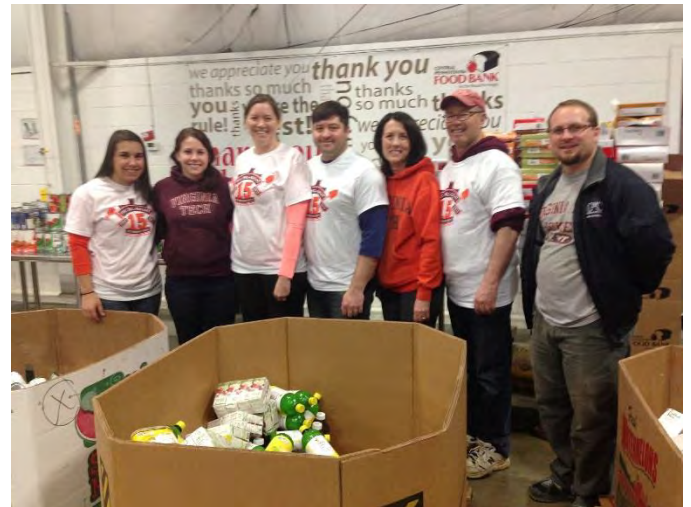
Central Pennsylvania sorted food at the Central Pennsylvania Food Bank