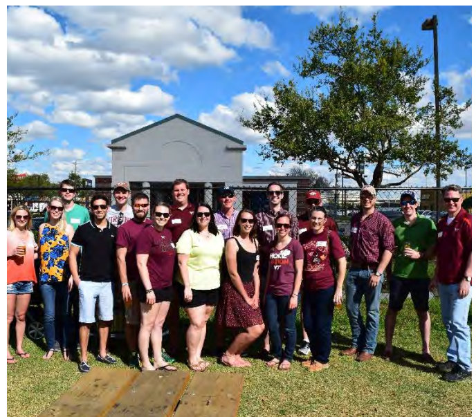
Houston Hokies gathered together in March for a networking event and tour at Karbach Brewing Co.