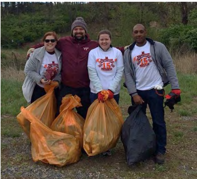
Roanoke Valley Chapter alumni provided roadside clean-up as part of Roanoke's Clean Valley Day