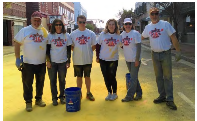
The New River Valley Chapter served as color throwers for the annual Color Me Cameron 5K Scholarship Run