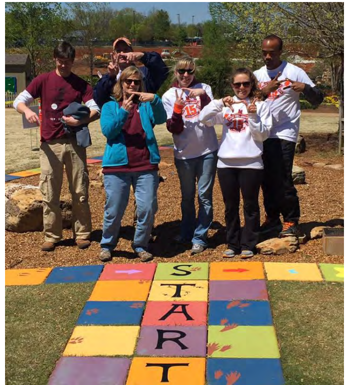
The North Alabama Chapter painted a children's game at their local botanical gardens