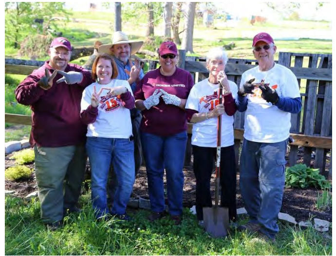
The Classic City Hokies in Athens, GA gathered to work at the UGarden, a community of students centered on a sustainable food system