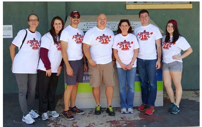
Central Florida Hokies took part in a community clean-up event, the "Waking of the Roses" at Lake Harriet