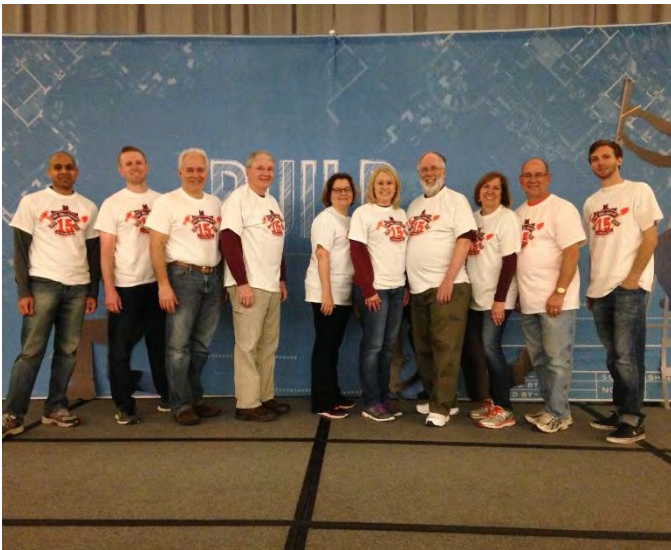
Minnesota Chapter volunteers take a break helping set up for Habitat for Humanity's Hard Hat & Black Tie Gala