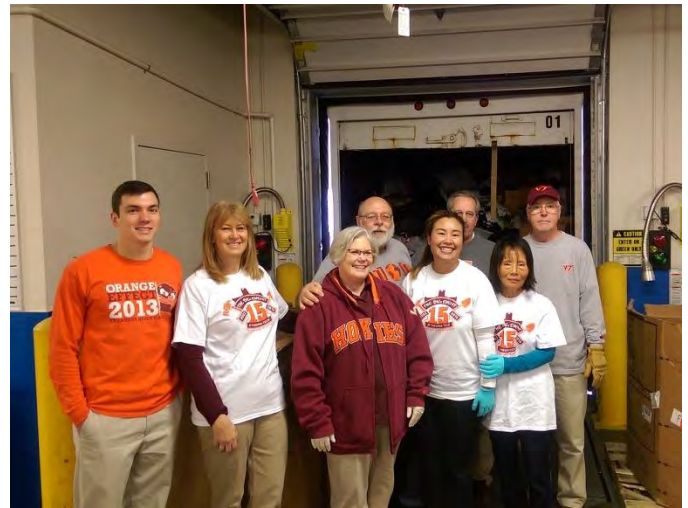
The Fredericksburg Chapter sorted and moved inventory at their local Goodwill thrift store