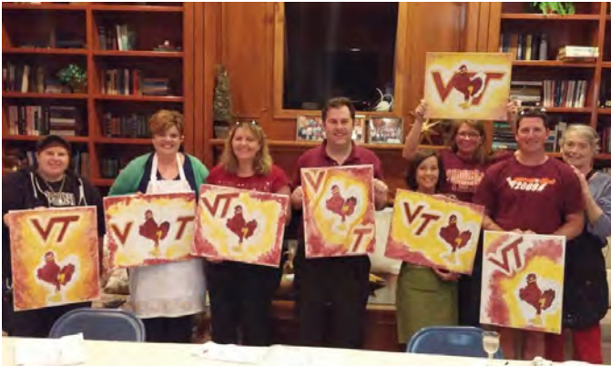
Jacksonville Chapter alumni joined together in April for a HokieBird painting session!