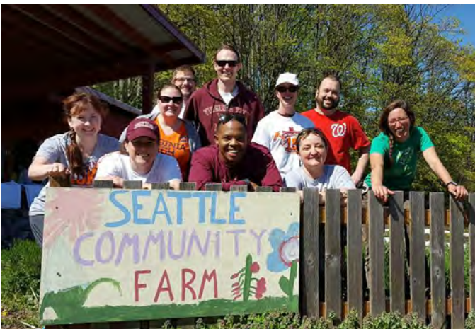
Seattle Chapter alumni get down and dirty with their annual project at Seattle Community Farm