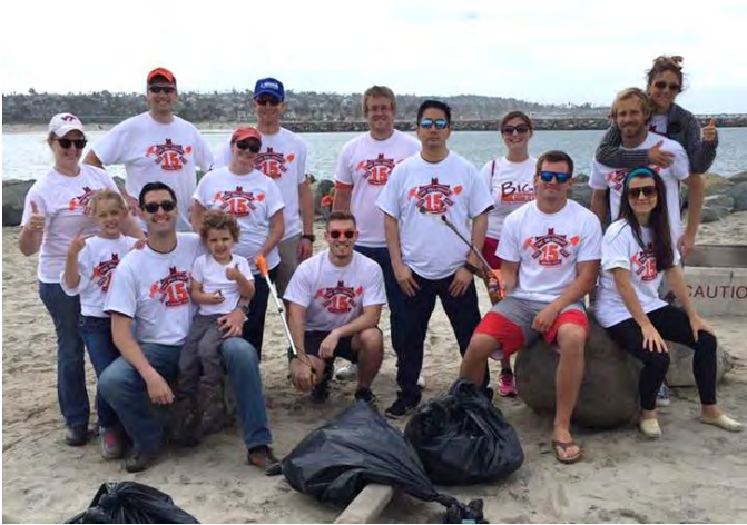
San Diego Hokies gathered on the sand for a beach clean-up project in their community