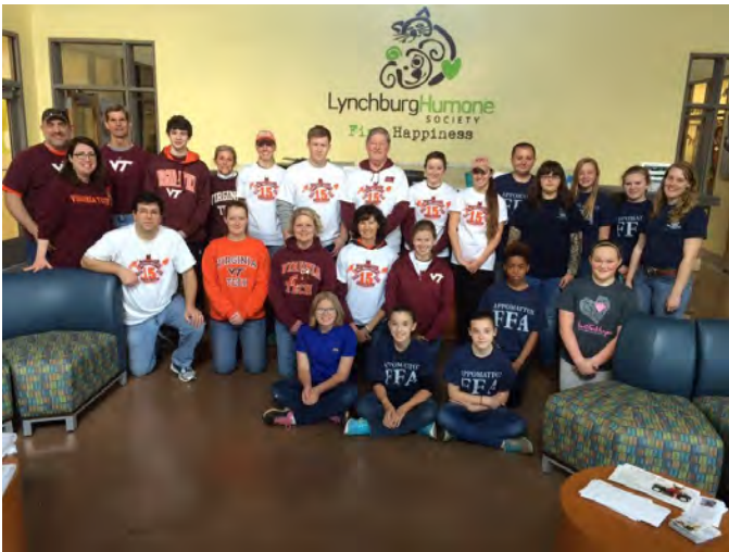
Central Virginia Chapter volunteers take a break from a hard day's work at the Lynchburg Humane Society