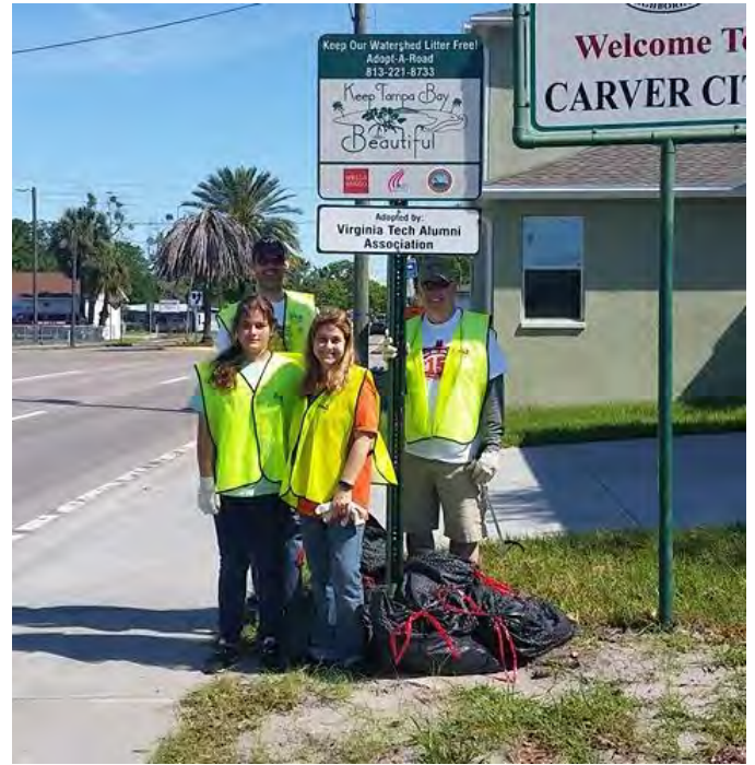
The Tampa Bay Chapter hosted their quarterly Adopt-a-Road project in conjunction with The Big Event