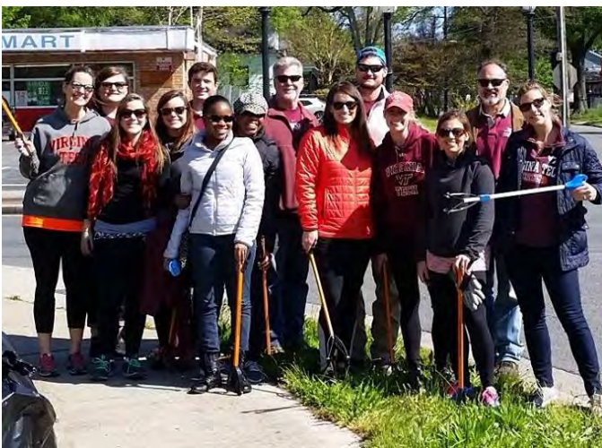
Another Charlotte Chapter group works together to clean-up the roads