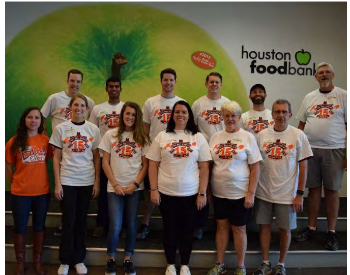
Houston Hokies took part in sorting and prepping food at the Houston Food Bank