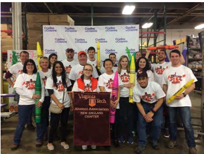
New England Chapter volunteers helped out at the Cradles to Crayons organization