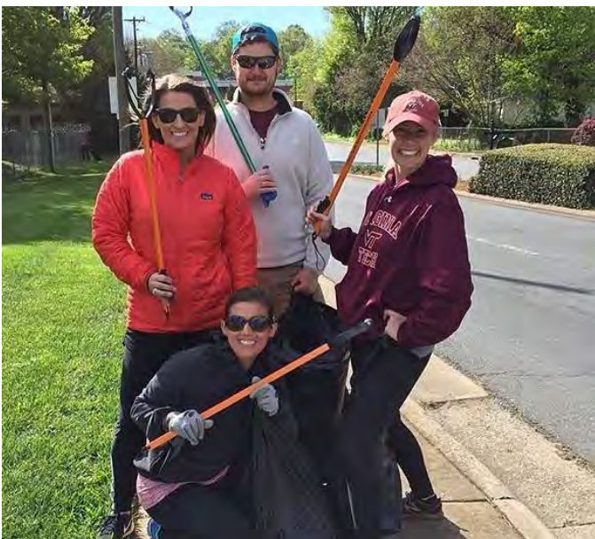
Charlotte Chapter alumni were hard at work at one of their Big Event projects; this is the Adopt-a-Road clean-up crew