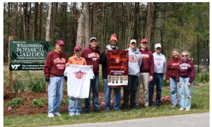
The Williamsburg Chapter volunteered for cleanup and maintenance at the Williamsburg Botanical Garden