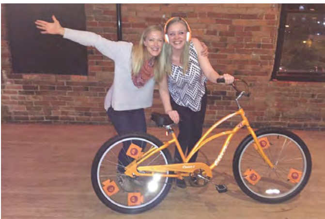
The Denver Chapter's annual Wine Tasting & Silent Auction included this Virginia Tech bike as an auction item