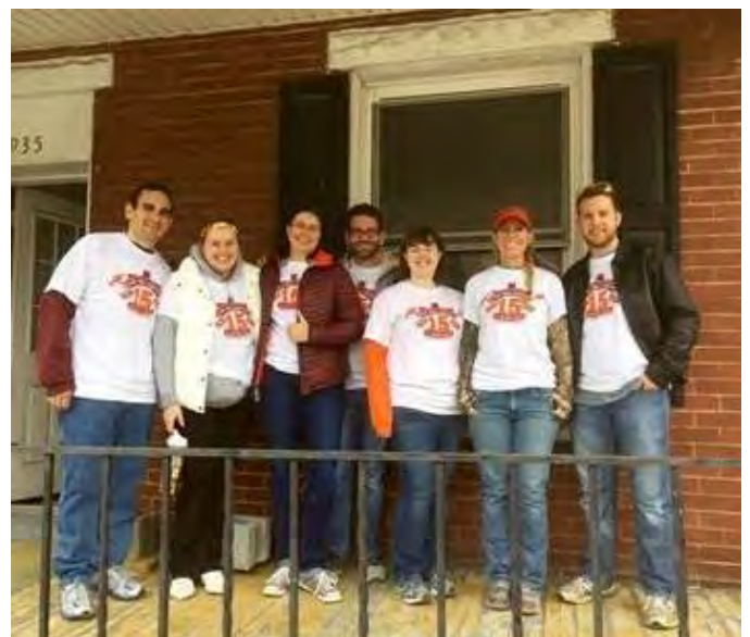
Western Maryland Hokies contributed manpower for a Habitat for Humanity build project