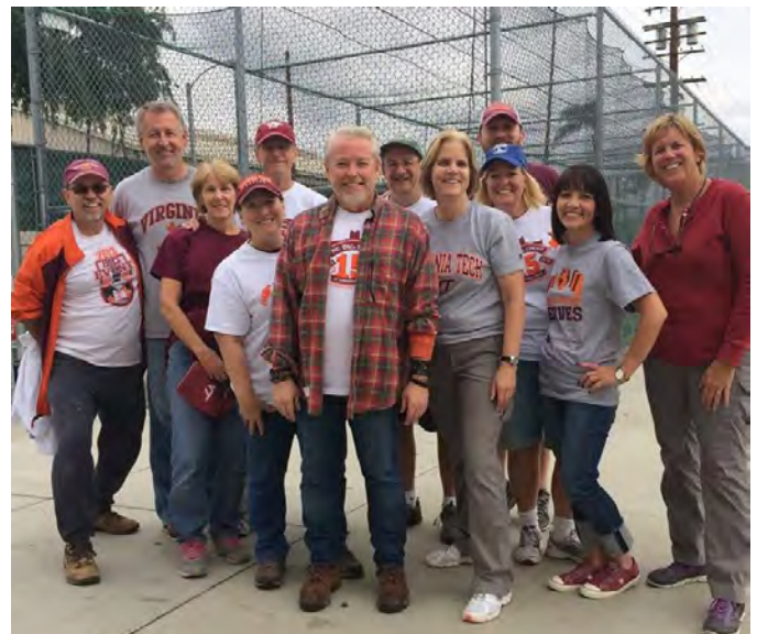
The Orange County Chapter repaired a backstop and batting cage at the Boys and Girls Club Teen Center