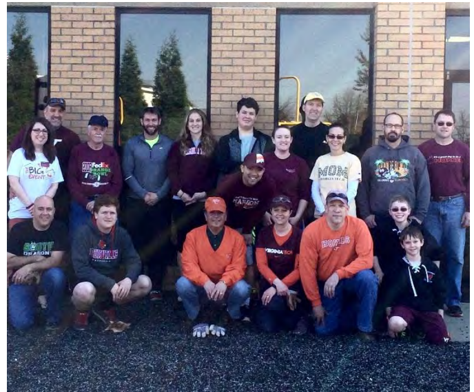
Kentuckiana Hokies participated in a clean-up at Kosair Charities, where they invited other ACC schools to join in