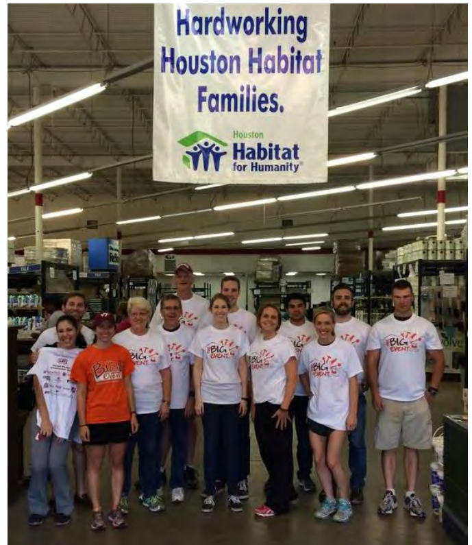
Houston Chapter volunteers helped in the warehouse and assisted customers at the local Habitat for Humanity ReStore