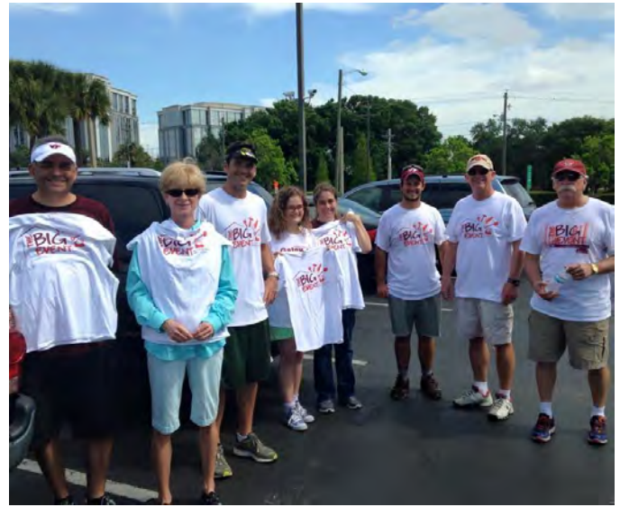
The Tampa Bay Chapter hosted their quarterly Adopt-a-Road project in conjunction with The Big Event