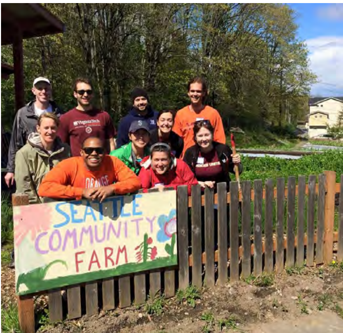
Seattle Chapter alumni get down and dirty with their annual project at Seattle Community Farm