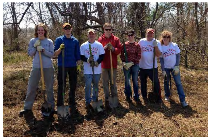
Baltimore Hokies participated in TWO events; these alumni provided landscaping labor at the Robinson Nature Center