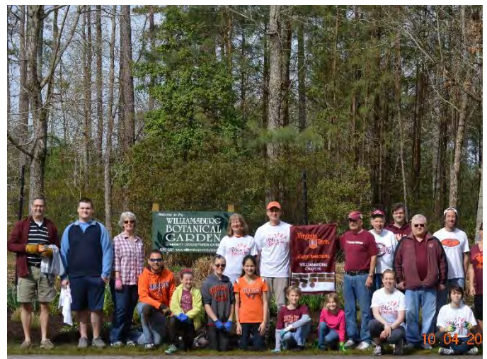
The Williamsburg Chapter helped install a new landscape at the Williamsburg Botanical Garden