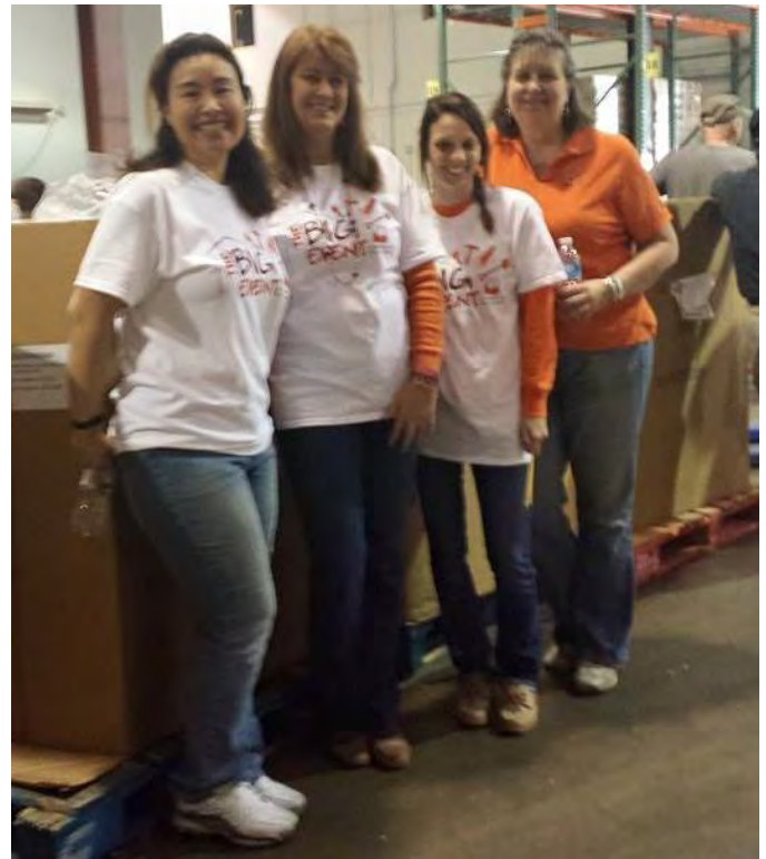
The Fredericksburg Chapter participated in a service project at the Fredericksburg Area Food Bank