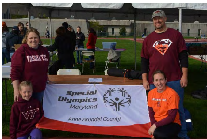
The Annapolis Chapter gathered to support their local Special Olympics event