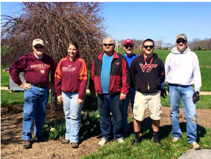
Shenandoah Chapter volunteers held their annual clean-up event at their local April 16 Memorial