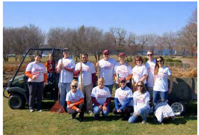
Minnesota Hokies took part in a community clean-up event, the "Waking of the Roses" at Lake Harriet