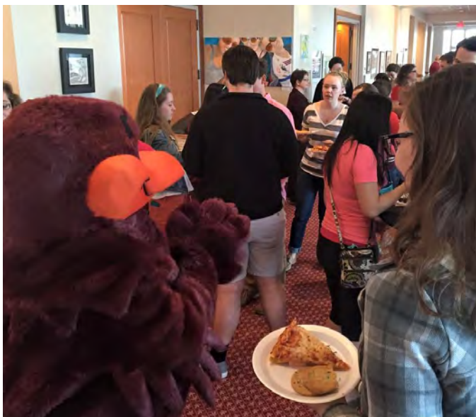
Alumni chapter scholarship recipients mingle with HokieBird at the Holtzman Alumni Center's annual pizza party

This year's chapter scholarship process is in full swing; visit our website for complete details and contact Ginny Ritenour for more information.