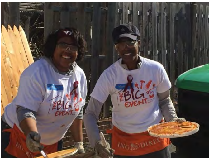
First State Chapter alumni were hard at work prepping and staining fencing sections for a Habitat for Humanity build