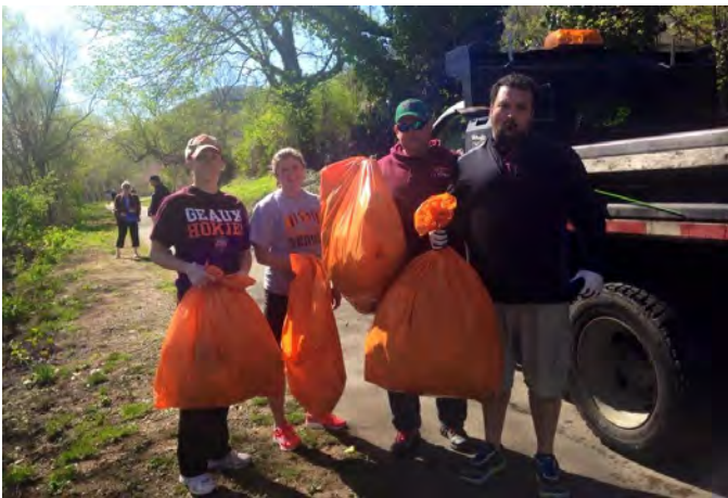
Roanoke Valley Chapter alumni provided roadside clean-up as part of Roanoke's Clean Valley Day