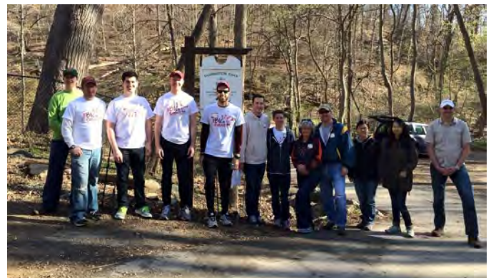
The National Capital Region Chapter also hosted two events; these alumni volunteered at Dumbarton Oaks Park