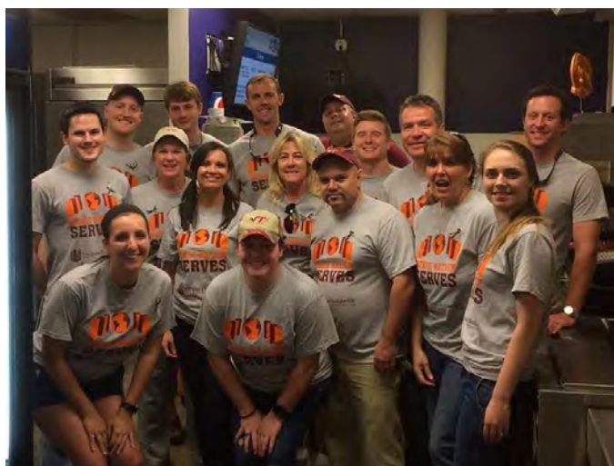
Palmetto Chapter alumni volunteer to work the concession stand at a Greenville Drive baseball game