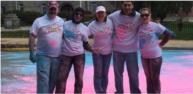
The New River Valley Chapter volunteered as "color throwers" at the local Color Me Cameron 5K