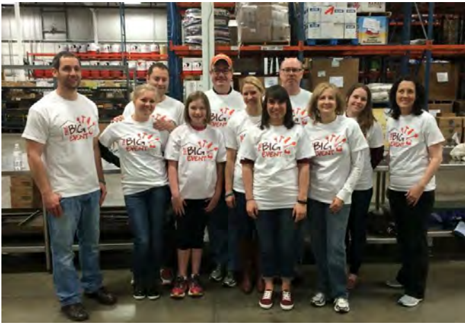
Central Pennsylvania volunteers take a break from stacking pallets of food at the Central Pennsylvania Food Bank