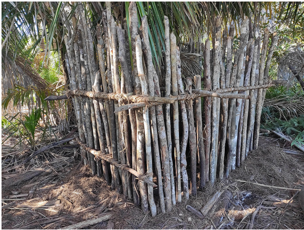
FIGURE 2 | Traditional wooden hand-made traps (Kotona), 2015 (Source: Rianja Rakotoarivony).

(minimum 1, median 5, maximum 50). Similarly, when kotona were used, a hunter used an average of 1.9 kotona per hunting season (minimum 1, median 2, maximum 5). There were no significant differences between the hunting techniques used per region, except for the spear, which was more commonly used in the SSW region.