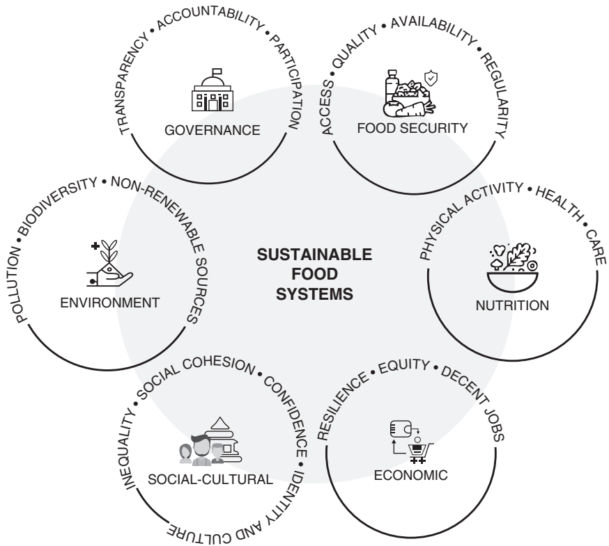
Figure 2.1 The dimensions of sustainable food systems.