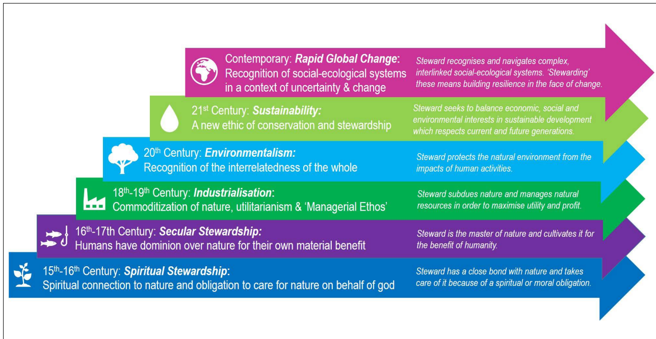
Figure 1: The changing meanings of environmental stewardship in Western history (adapted from Worrell and Appleby 5 , Berry 11 and McArthur 12 ).

the sustainability sciences and social-ecological systems fields 3,4,9,21 , despite widely debated critiques of the concept 11,14,17 .