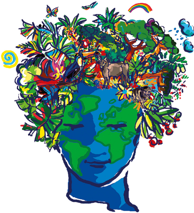
Fig. 1 Vibrant and innovative local-specific human-driven systems as engine for a profound food system transformation. Illustrates the profound food system transformation that is required to achieve the 2030 Agenda on Sustainable Development and the Paris Agreement on Climate and that is made of four parts (nutritious and healthy food, sustainable agricultural production and food value chains, mitigation of climate change and resilience, renaissance of rural territories). Such a transformation relies on the capacity to design and implement local specific innovation based initiatives to address local and national expectations through diverse adapted pathways. It also depends on the capacity to stimulate such initiatives and to orchestrate such a transformation at the global level to ensure orientation and consistency among scales

links with production, value chains, the environment, nutrition, and health (Porter et al. 2014). Sustainable and nutrition-sensitive food consumption patterns should be supported through favorable food environments (HLPE 2017b). Dietary changes and reductions in food wastage are core elements of the SDG for sustainable consumption and production (goal 12) and, more broadly, of all SDGs.