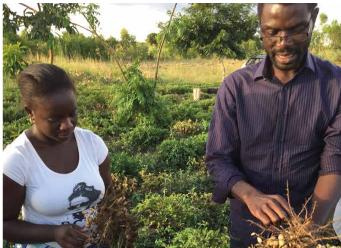
Researcher and producer discuss the health status of groundnuts in Malawi.

PAEPARD has created a dynamic among the stakeholders of ARD in encouraging them to create an inclusive partnership process