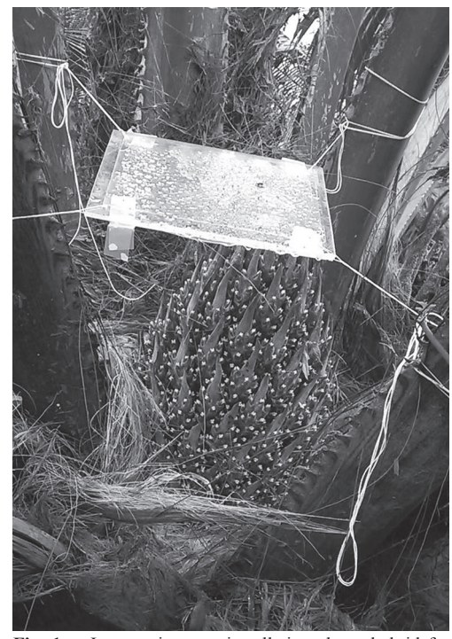
Fig. 1. – Interception trap installation above hybrid female inflorescence of Elaeis in anthesis.

then protected with transparent foil on which the sticky tape with the reference information was transferred. The insects captured on each side of the above plates placed in the vicinity of inflorescences were identified and counted. The species identifications and capture scores were determined with a portable 20× magnification stereoscopic microscope (Naturescope, Nikon, Japan). The identification of Elaeidobius spp. occurred using a simple identification key (RIPOLL, 2009). Grasidius hybridus was also identified (O'BRIEN et al. , 2004). The numbers of insects captured on both sides of the trap were combined.