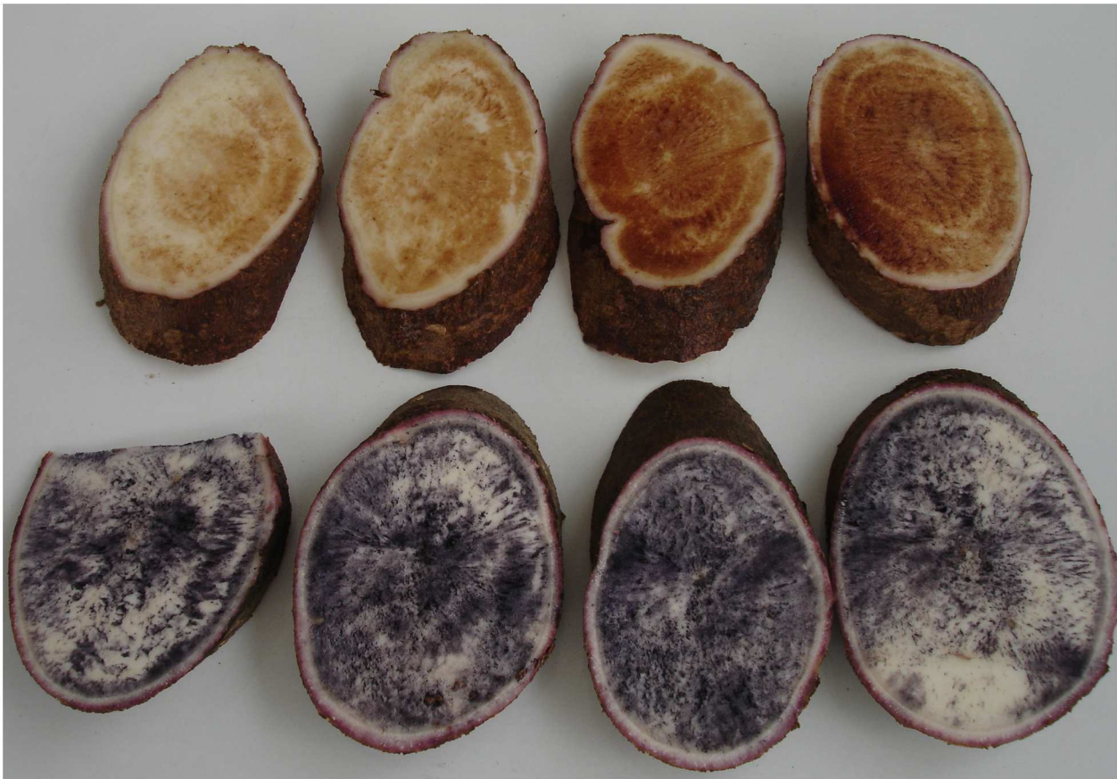
FIGURE 2 | Illustration of the staining technique based on an iodine solution used to identify roots with waxy starch (staining reddish) or amylose-containing wild type starch (staining blue).