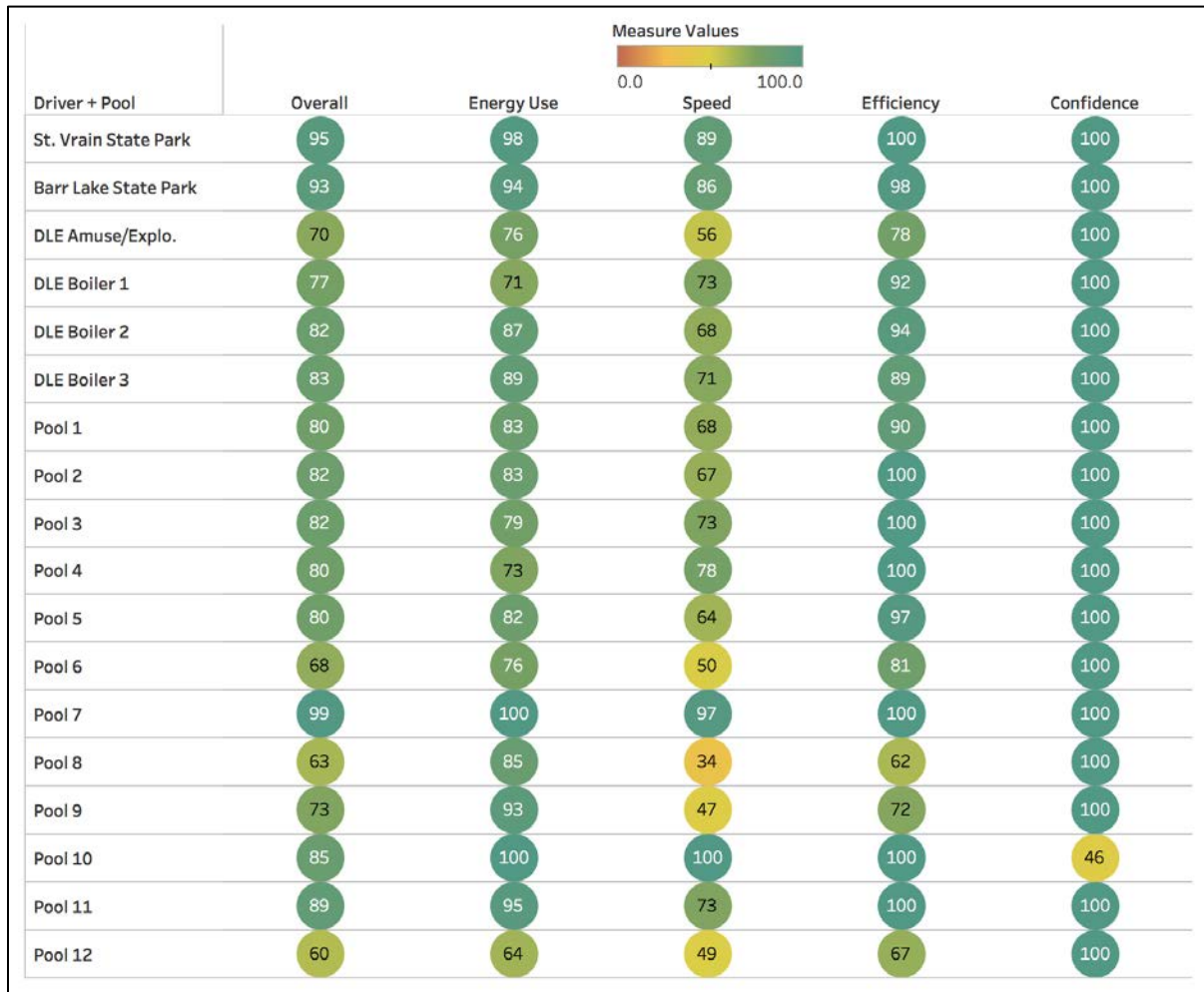
Figure 4. EV Suitability scores by vehicle for Colorado

The EVSA were completed for DLE’s Division of Oil and Public Safety based on data collected from August 16 through December 31. Whereas the DNR vehicles analyzed exhibited a relatively compact geographic footprint and need in terms of the range of the vehicles, the DLE vehicles showed the opposite. They all had frequent days with long-distance travel to rural parts of Colorado, as well as overnight trips to some of the destinations mentioned earlier.