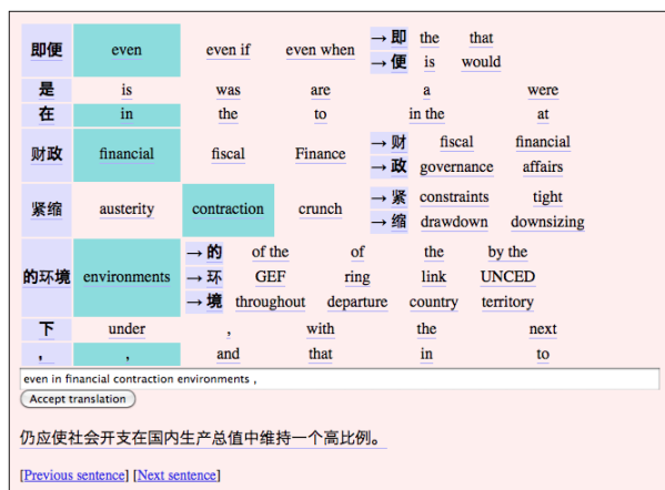
Figure 2. The interface for displaying translation options, with two null selections (rows 2 and 7) and one alternative selection (row 5). This set of selections corresponds to a total of three clicks, the minimum number required to produce this set of selections.