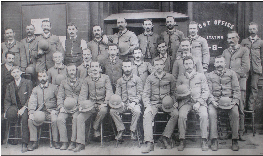
Employees of Station S, Brooklyn, New York, Post Office, in 1888 Station S, established in 1885, was renamed Bushwick in 1947. It still serves Brooklyn residents.

In the 1890s the Post Office Department favored consolidating smaller, suburban Post Offices with larger ones to provide more customers with free delivery, to streamline and modernize management, and to bring more employees into the classified civil service. 8 In July 1894, the delivery area of the Chicago Post Office almost doubled — providing service to nearly 97 percent of the city's inhabitants — when 59 independent Post Offices "within the confines of Chicago" were consolidated with the Chicago Post Office. 9 Most of the discontinued Post Offices were converted to stations, often superintended by their former postmasters. The stations provided identical service to customers but were administratively subordinate to the Chicago Post Office.