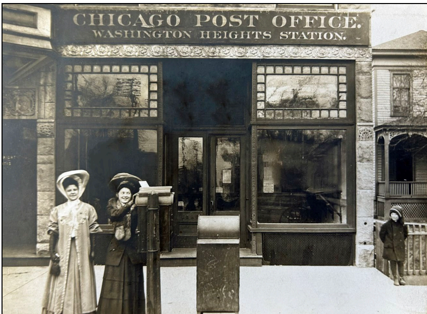
Washington Heights Station, Chicago, Illinois, circa 1900 In 1894 the Washington Heights Post Office was discontinued and replaced by "sub-station No. 48" of the Chicago Post Office, a contract station. In 1898 the contract station was replaced by the Washington Heights Station, a classified station providing carrier delivery.

In the 1890s the Post Office Department favored consolidating smaller, suburban Post Offices with larger ones to provide more customers with free delivery, to streamline and modernize management, and to bring more employees into the classified civil service. 8 In July 1894, the delivery area of the Chicago Post Office almost doubled — providing service to nearly 97 percent of the city's inhabitants — when 59 independent Post Offices "within the confines of Chicago" were consolidated with the Chicago Post Office. 9 Most of the discontinued Post Offices were converted to stations, often superintended by their former postmasters. The stations provided identical service to customers but were administratively subordinate to the Chicago Post Office.