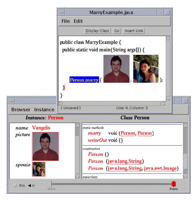
Figure 3. Example customisation