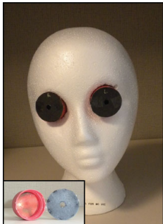
Fig. 2 Assembled FAK-I with fundus photo inside bottle cap and black card stock cover (inset). FAK-I mounted in Styrofoam head.

Eight of the 40 students had been previously assigned an elective 2-week ophthalmology rotation during their surgical