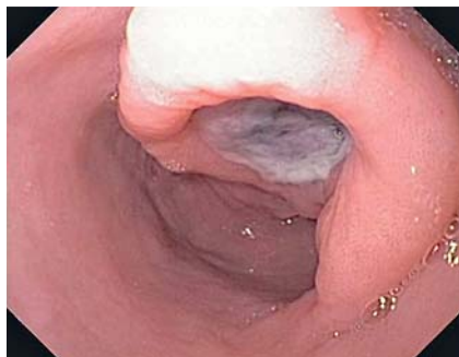
Fig. 1 Large subepithelial lesion at the incisura with a deep clean-based ulcer.

Bleeding gastrointestinal stromal tumors (GISTs) have historically been managed with either surgical resection or radiologic embolization. Occasional reports exist of endoscopic therapies such as hemoclips [1], endoloop ligation [2], and endoscopic ultrasound (EUS)-guided angiotherapy [3]. We herein present the case of an elderly patient with recurrent bleeding from a large gastric GIST who was successfully treated with EUS-guided angiotherapy.