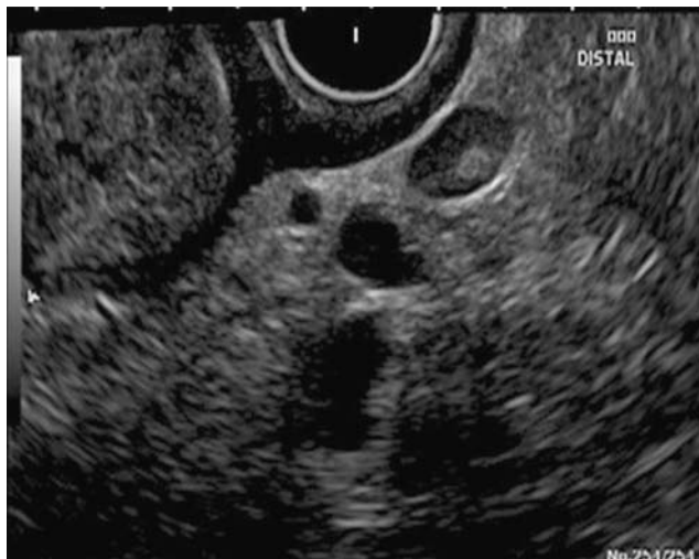
Fig. 2 Endoscopic ultrasound image showing the typical appearance of a gastrointestinal stromal tumor (GIST) with an associated malignant-appearing lymph node.

EUS-guided angiotherapy was considered a suitable option. A curved linear-array echoendoscope (Olympus GF-UC(T)140P-OL5; Olympus America Inc., Center Valley, Pennsylvania, USA) was used, and a vessel deep to the GIST ulcer was identified. Pulse wave Doppler confirmed arterial flow (● Fig. 3 ; ● Video 1 ). After the patient had been given an intravenous injection of cefotetan 2 g, a 19-gauge needle (Flex 19; Boston Scientific, Natick, Massachusetts, USA) was used to puncture the target artery and 2 mL of N-butyl 2-cyanoacrylate (Histoacryl; B. Braun Medical,