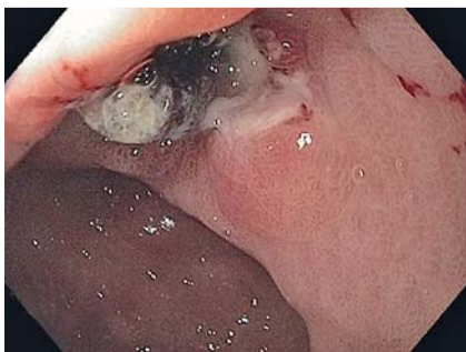
Fig. 5 Endoscopic view 4 weeks after angiotherapy showing the ulcer, which had reduced in size from 15 mm to 7 mm, along with a small volume of extravasated cyanoacrylate.

Bethlehem, Pennsylvania, USA) was injected followed by an immediate flush of 2 mL of 5% dextrose.