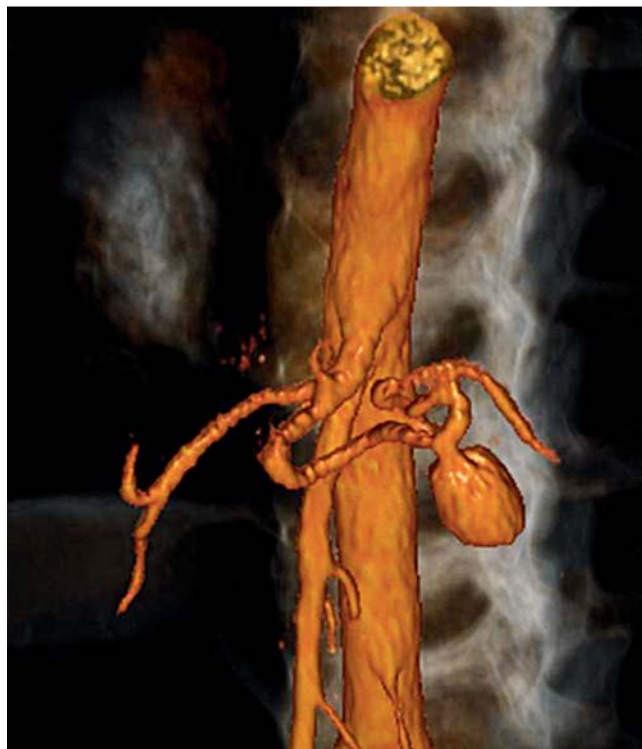
Fig. 2 Three-dimensional (3D) computed tomography (CT) angiogram showing the pseudoaneurysm of the splenic artery.