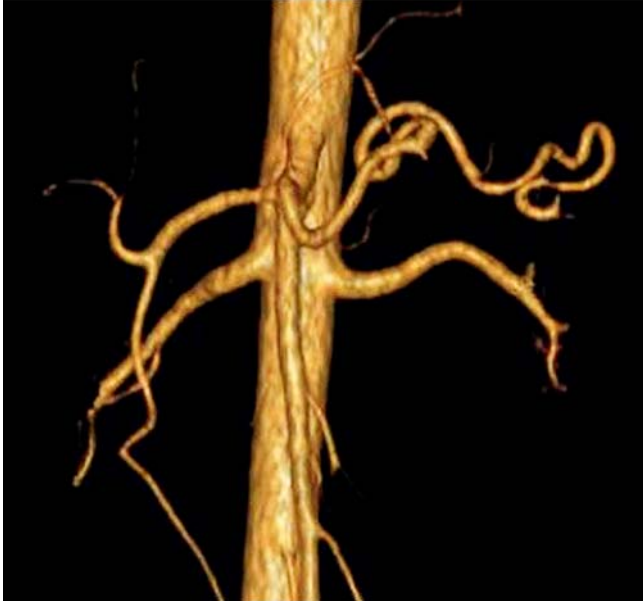
Fig. 5 Three-dimensional (3D) computed tomography (CT) angiogram taken 4 months later showing the splenic artery without the pseudoaneurysm sac.

formed. Although long-term follow-up is not yet available, the technique seems to be promising.