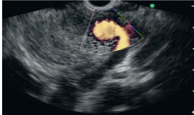
Fig. 1 Color Doppler image of the pseudoaneurysm.

There have been few reports published that describe the procedure of thrombin injection into visceral pseudoaneurysms under EUS guidance [3]. An important point to be considered is the presence of a small neck forming the communication between the pseudoaneurysm and the artery, which increases the success of the treatment and decreases the risk of distant embolization. EUS-guided treatment of visceral pseudoaneurysms with thrombin injection can be successfully per-