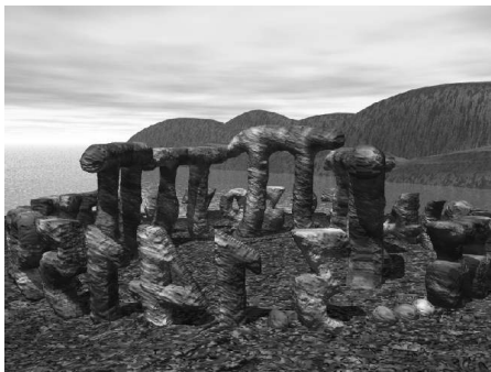
Pi-henge by Lisa Hakesley

sense, numbers that existed were numbers that could be drawn with just an unmarked ruler and compass. The rules allowed for starting with a fixed length of 1 and seeing what could be constructed with straight edge and compass alone. (Our current notion is much more based on counting.) The question of whether \pi is a constructible magnitude had been explicitly raised as a question by the sixth century BC and the time of the Pythagoreans. Unfortunately \pi is not constructible, though a proof of this would not be available for several thousand years. In this context there isn't a more basic question than "is \pi a number?" Of course, our more modern notion of number embraces the Greek notion of constructible and doesn't depend on construction. The existence of \pi as a number given by an infinite (albeit unknown) decimal expansion poses little problem.