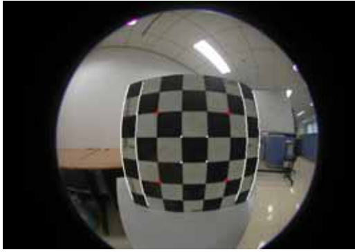
Figure 2. One of real fisheye image sequence