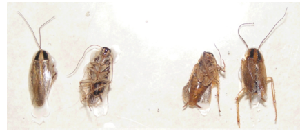
Field cockroaches & German cockroaches