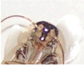
Field cockroach's face

The easiest characteristic to use to distinguish between them is the line between the eyes of the Field cockroach as shown below: