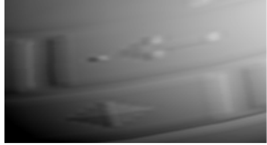
Figure 3: A bump-mapped torus sampled with Catmull-Rom reconstruction filtering