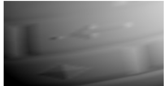
Figure 4: The torus sampled with bilinear interpolation of gradients

signal properly. Such filter is said to perform low-pass filtering below the Nyquist limit, and could be useful if we want to smoothen the original signal. Cubic B-splines and Catmull-Rom spline filters will be examined to ascertain this property. The effect of different filtering techniques will be shown in a number of images. A torus is bump mapped and a portion of the torus is magnified so that the effect of the filters could be compared. The bump that the arrow in the images is pointing at is a one texel bump, that is, one height value differs from the others surrounding it.