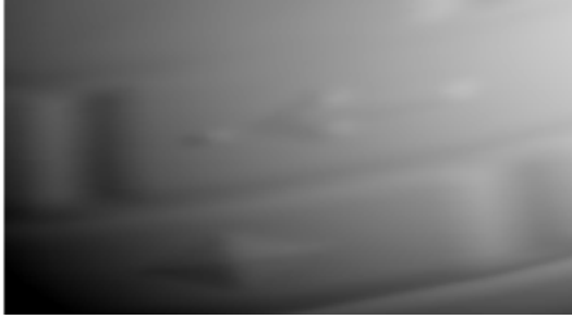
Figure 1: A bump-mapped torus sampled using B-spline reconstruction filtering