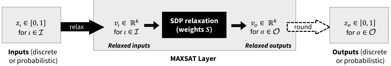
Figure 1. The forward pass of our MAXSAT layer. The layer takes as input the discrete or probabilistic assignments of known MAXSAT variables, and outputs guesses for the assignments of unknown variables via a MAXSAT SDP relaxation with weights S .

variable i \in \{1, \dots, n\} , and define \tilde{s}_i \in \{-1, 0, 1\}^m for i \in \{1, \dots, n\} , where \tilde{s}_{ij} denotes the sign of \tilde{v}_i in clause j \in \{1, \dots, m\} . We then write the MAXSAT problem as