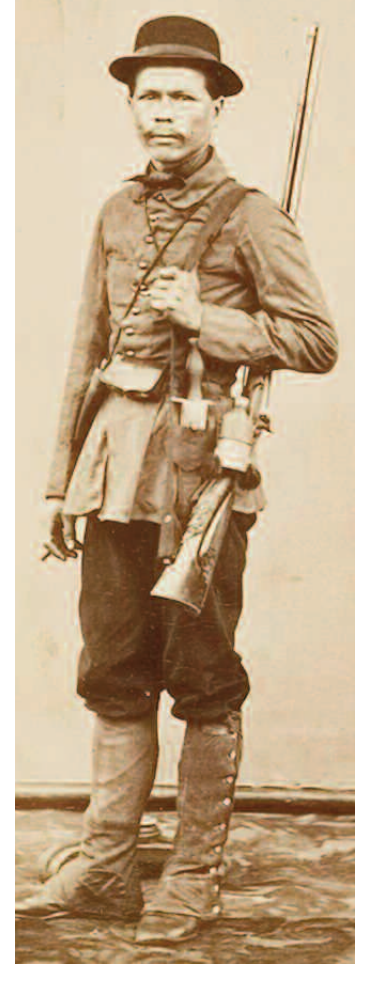
FIG. 15. 'Man from Ternate, dressed in hunting costume'; photograph by Woodbury & Page, c.1870. (Courtesy of KITLV/Royal Netherlands Institute of Southeast Asian and Caribbean Studies). While there is no indication that the man in this photograph is Ali, if he did continue to work as a hunter, this is how he might have looked by 1870.

Wallace's praise of Ali has often been quoted. But it is all the more remarkable if we realize the surprising number of assistants Wallace employed in the archipelago. The surviving evidence reveals well over 100 men worked for Wallace during his voyage, as