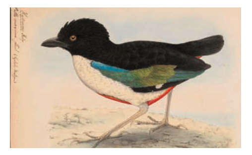
FIG. 5. The Ivory-breasted Pitta ( Pitta maxima maxima ) which Wallace called 'one of the most beautiful birds of the East', shot by Ali on Gilolo.

When they returned it was time to prepare for another major expedition—and the reason that they had come to Ternate. They were to take a passage on a trading schooner that would sail to the almost inaccessible island of New Guinea, the main home of the Birds of Paradise.