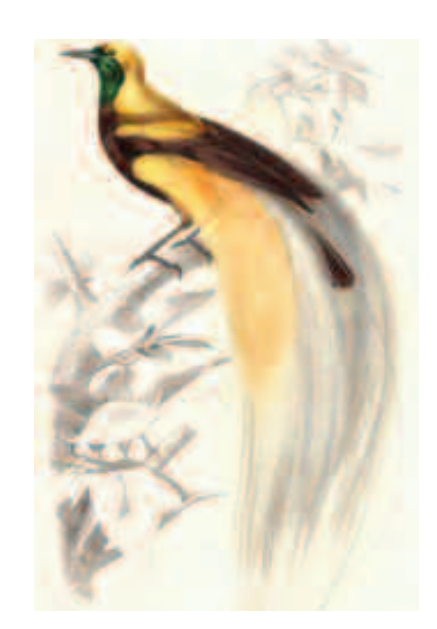
FIG. 2. Ali would have shot specimens of the King Bird of Paradise ( Cicinnurus regius ) on Aru. This bird inspired one of the most moving passages in Wallace's Malay Archipelago . ( Source : Sharpe, 1891–8).