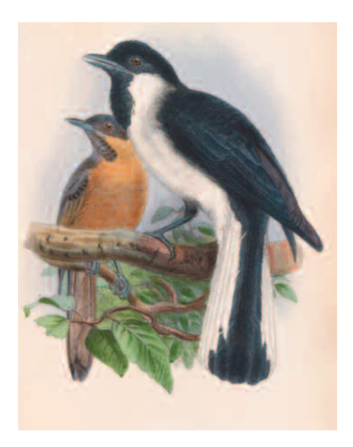
FIG. 10. The Black-tipped Monarch ( Monarcha loricatus ) from Bouru. Likely taken by Ali. ( Source : Wallace 1863)