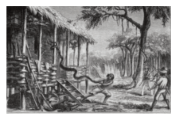
FIG. 4. 'Ejecting an intruder', a woodcut from the Malay Archipelago . Ali is presumably one of the figures standing nearby although this was drawn by an artist in Britain after the voyage. ( Source : Wallace 1869)

in the middle of the island of Amboyna. It was here that Wallace noticed a giant python in the rafters of his hut. He called out to his two boys who were skinning birds outside. "Here's a big snake in the roof" but as soon as I had shown it to them they rushed out of the house and begged me to come out directly.'<sup>36</sup> Wallace found a local man to despatch the snake. This episode is depicted in the dramatic illustration 'Ejecting an intruder' in the Malay Archipelago (Fig. 4).