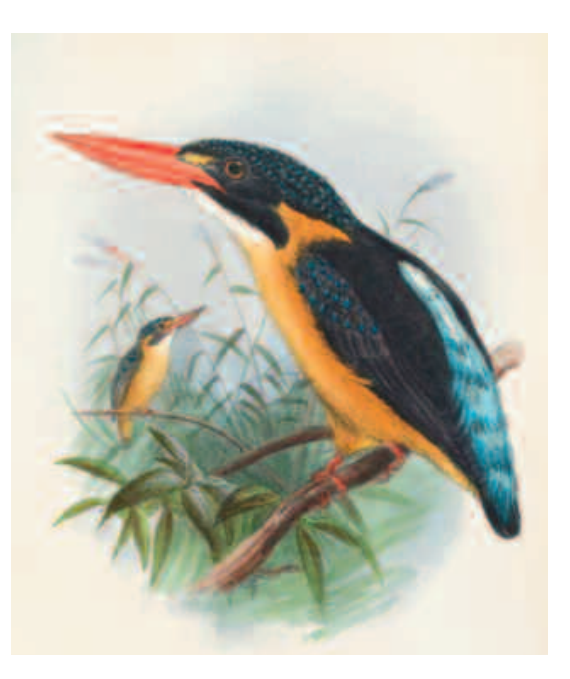
FIG. 9. The Buru Dwarf-kingfisher ( Ceyx cajeli ) from Bouru. Likely taken by Ali. ( Source : Wallace 1863)

Soon after we had arrived at Waypoti, Ali had seen a beautiful little bird of the genus Pitta, which I was very, anxious to obtain, as in almost every island the species are different, and none were yet known from Bouru. He and my other hunter continued to see it two or three times a week, and to hear its peculiar note much oftener, but could never get a specimen, owing to its always frequenting the most dense thorny thickets, where only hasty glimpses of it could be obtained, and at so short a distance that it would be difficult to avoid blowing the bird to pieces.