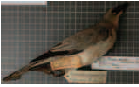
FIG. 6. A White-bellied Cuckooshrike ( Coracina papuensis melanolora ). A bird skin probably prepared by Ali on Ternate in 1858. Now in the Netherlands Centre for Biodiversity Naturalis, Leiden.