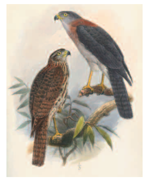
FIG. 11. The Rufous-necked Sparrowhawk ( Tachyspiza erythrauchen ) collected by Ali on Bouru.