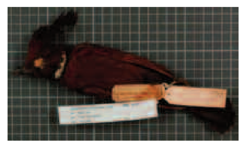
FIG. 12. A Crested Jay ( Platylophus galericulatus coronatus ). A bird skin probably prepared by Ali on Sumatra in November 1861. Now in the Netherlands Centre for Biodiversity Naturalis, Leiden.