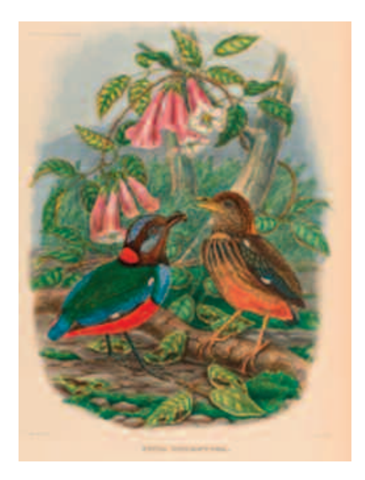
FIG. 8. The Red-bellied Pitta ( Erythropitta rubrinucha ) from Bouru. Taken by Ali. ( Source : Elliot 1893–5)

On 15 June 1861 Ali went to a place called Telaya and returned the following day. He bagged a colourful new bird. Wallace recorded it emphatically in his notebook as 'Ali back. 1 Pitta!!!' (Fig. 8).<sup>59</sup> This is apparently the bird Wallace described in the Malay Archipelago .