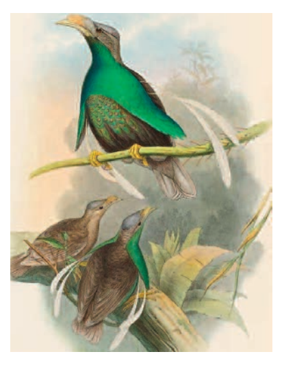
FIG. 7. Wallace's Standard Wing ( Semioptera wallacii ), discovered by Ali.

Just as I got home I overtook Ali returning from shooting with some birds hanging from his belt. He seemed much pleased, and said, 'Look here, sir, what a curious bird,' holding out what at first completely puzzled me. I saw a bird with a mass of splendid green feathers on its breast, elongated into two glittering tufts; but, what I could not understand was a pair of long white feathers, which stuck straight out from each shoulder. Ali assured me that the bird stuck them out this way itself, when fluttering its wings, and that they had