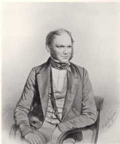
Charles Darwin, 1849