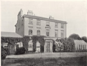
The Mount, Shrewsbury