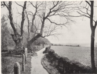
The Sandwalk at Down