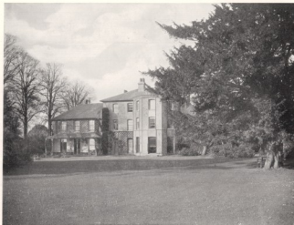
Mr Darwin's House at Down