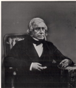
John Stevens Henslow