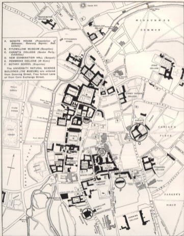
Map of Cambridge