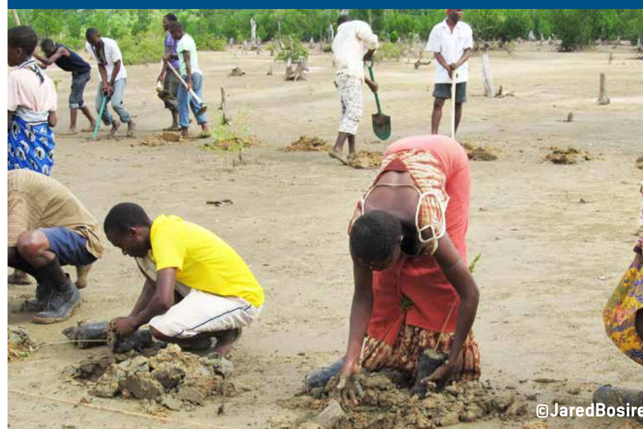
Stress reduction through community engagement and empowerment in sustainable resources management