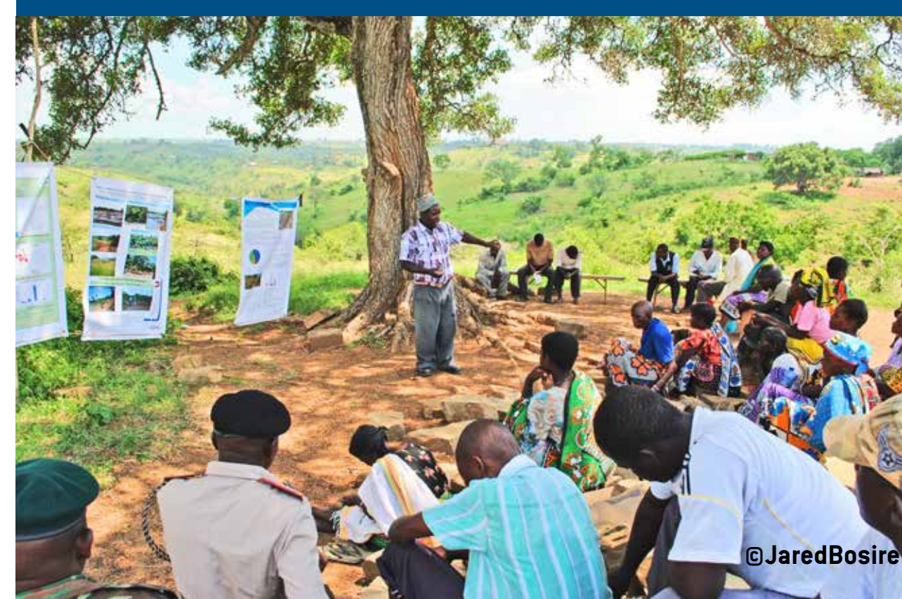
Capacity development to realise improved ocean governance in the WIO region