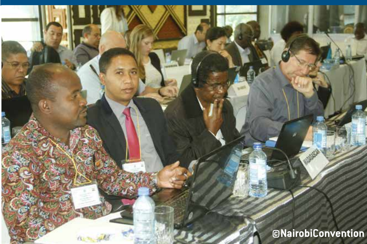
Supporting policy harmonization and management reforms to improve ocean governance