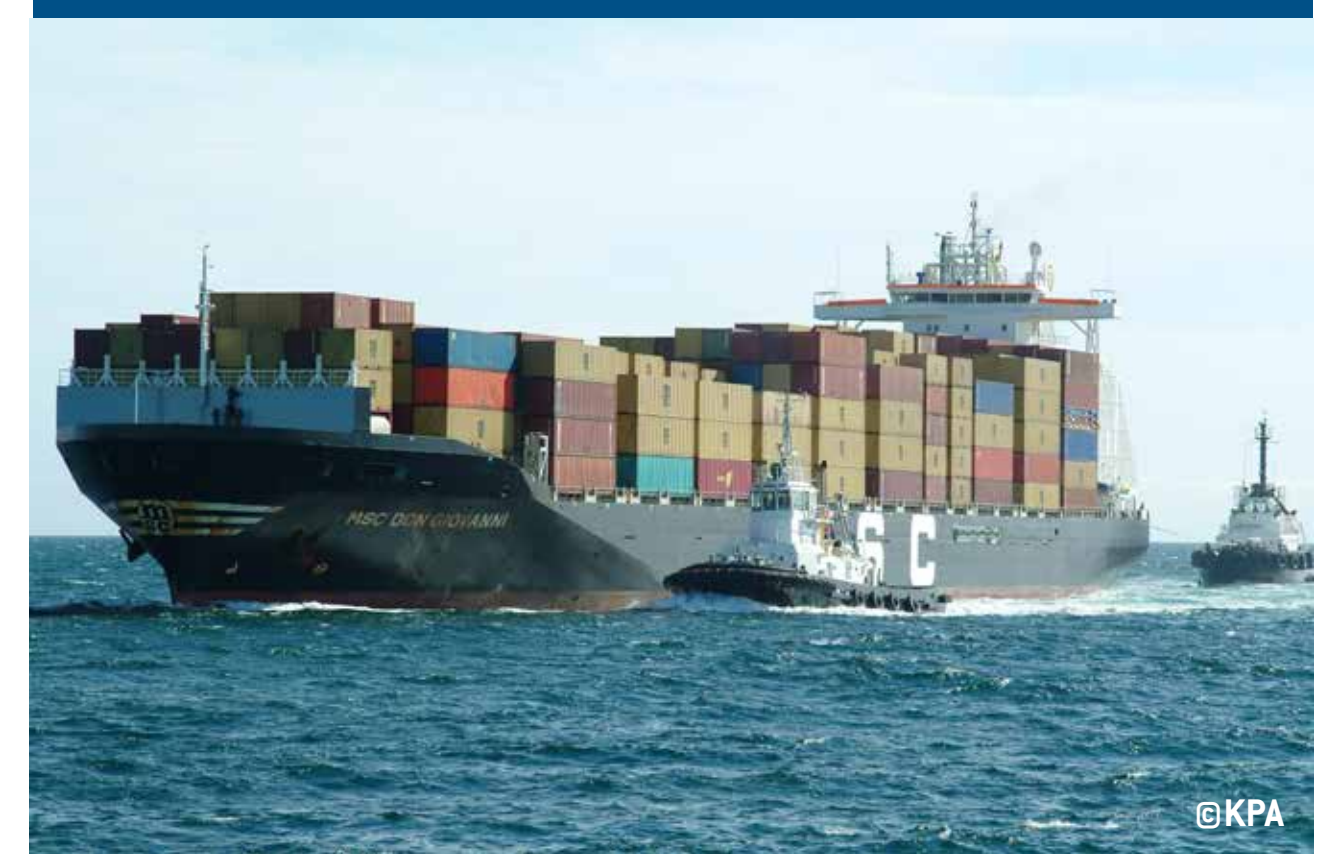
Stress reduction through private sector/industry commitment to transformations in their operations and management practices