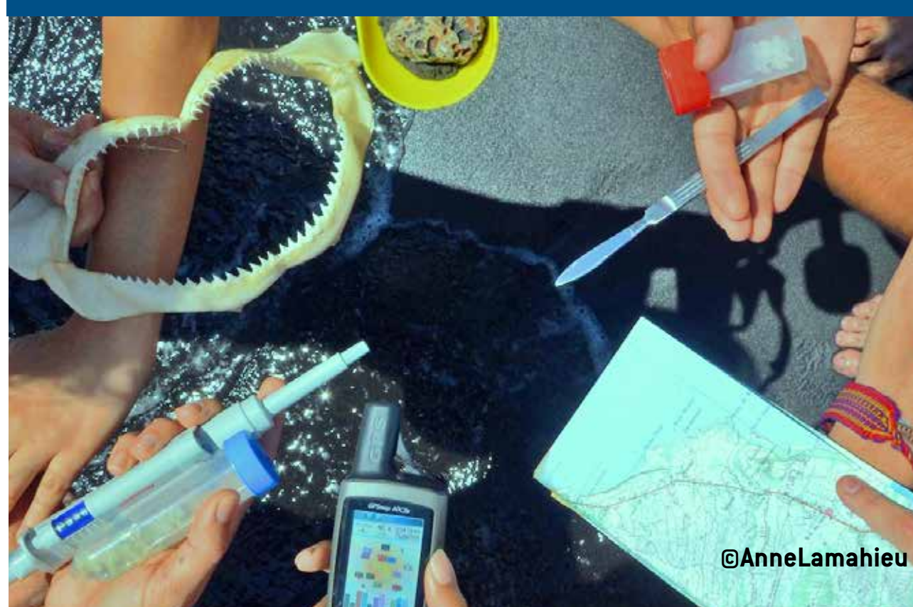
Delivering best practices and lessons through innovative ocean governance demonstration