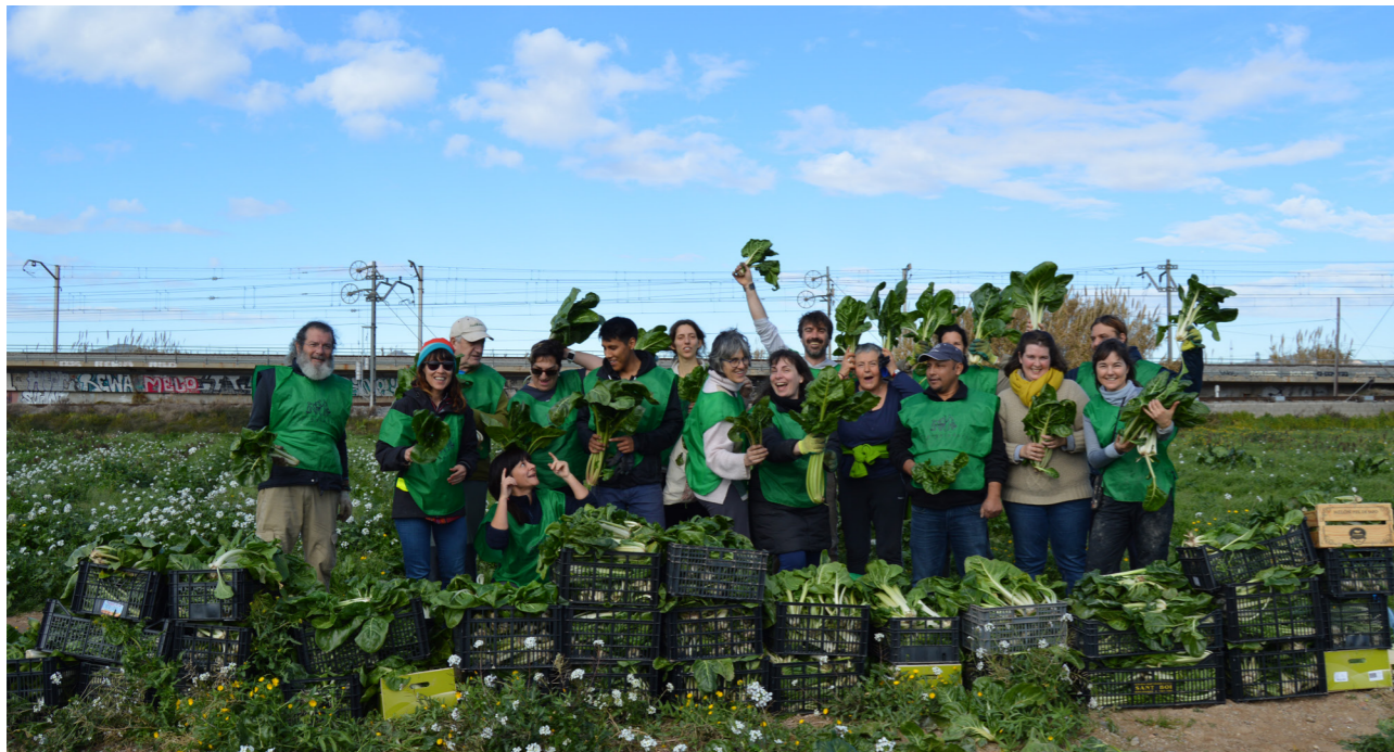
Volunteers of Espigoladors Foundation in a gleaning activity (Source: Espigoladors Foundation, 2019).

Therefore, it is necessary to be aware that all volunteers will have to be registered as part of the activity beforehand, in order to process the appropriate insurance and guarantee adherence to the previously cited law.