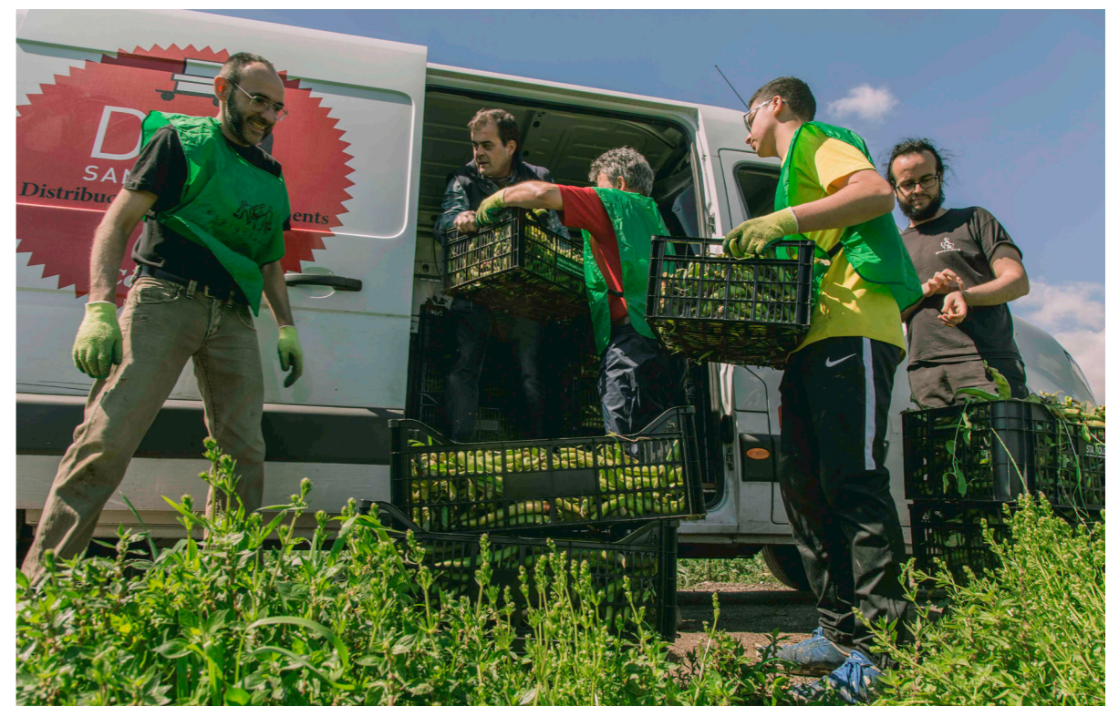
Volunteers of Espigoladors Foundation help to load the gleaned product to the van of a FDS.

Dialogue with the FDS should be maintained in order to better understand their needs and their real capacities for storage and redistribution of fresh produce.