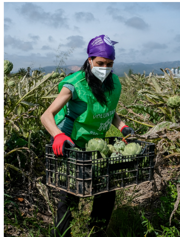
Volunteer of Espigoladors Foundation.

Further, the GO will remind volunteers about the importance of punctuality, the key elements of risk prevention (dressing, footwear, hat, etc.), and the need to remain flexible in the face of possible last-minute changes caused by unforeseen inclement weather or ripening of the fruit and vegetables to be gleaned.