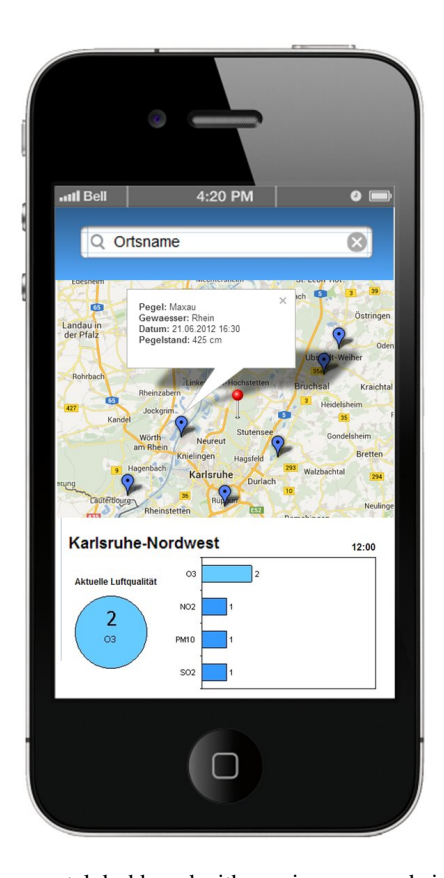
Fig. 2. Environmental dashboard with preview map and air quality data

Starting at the dashboard the user has additional possibilities to navigate to a more sophisticated query form, a more detailed display of a single item, or even to the original information system. We believe that in most cases a quick overview with a reduced complexity at the dashboard will meet the user's needs. I.e., a user frequently may be interested in the actual ozone levels before going jogging. With sports in mind he rarely is interested in querying a time series of ozone data at his location, even if he could do so.