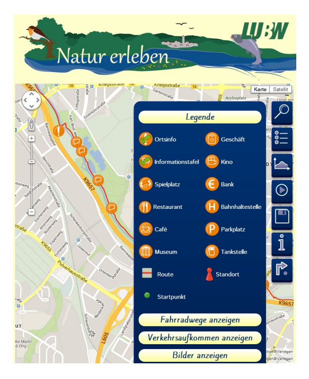
Fig. 4. Display of environmental and touristic information along a given track creating an environmental experience for the user. (Prototype by N. Bayer).

like Google Maps for Business [9] when original systems do not provide standardized interfaces or are not powerful enough to cope with a large number of simultaneous requests. Structured or binary data may be stored in the cloud using services like Google Fusion Tables or Google Drive and the respective APIs [10, 11]. The discussion of the use of cloud services will be subject of another publication.