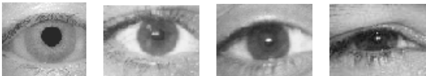
(a) CASIA image database. (b) UBIRIS image database (Reflection). (c) UBIRIS image database (Focus). (d) UBIRIS image database (Visible Iris).

On table 1 we show the results obtained by each described iris image segmentation method.